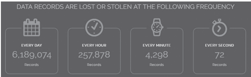
Figure 2: Frequency of loss or theft of records