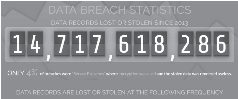
Figure 1: Statistics on records lost or stolen since 2013

ure 1), of which 3,353,172,708 records in the first half of 2018 alone, with an average of 72 records per second, respectively 6,189,074 records each day (Figure 2). That number represents a 72% increase over the first quarter of 2017.