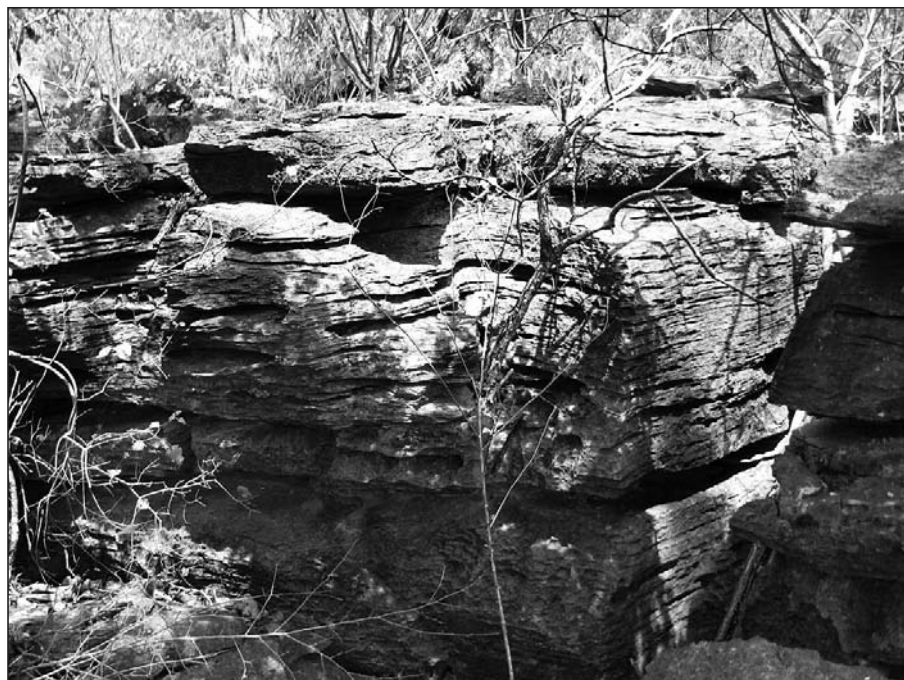
Fig. 5: Fissured and laminated rock.

Pits and cups also occur under the moss, lichen, and algae that cover the rock in places and often dissect the bottoms of subsoil channels.