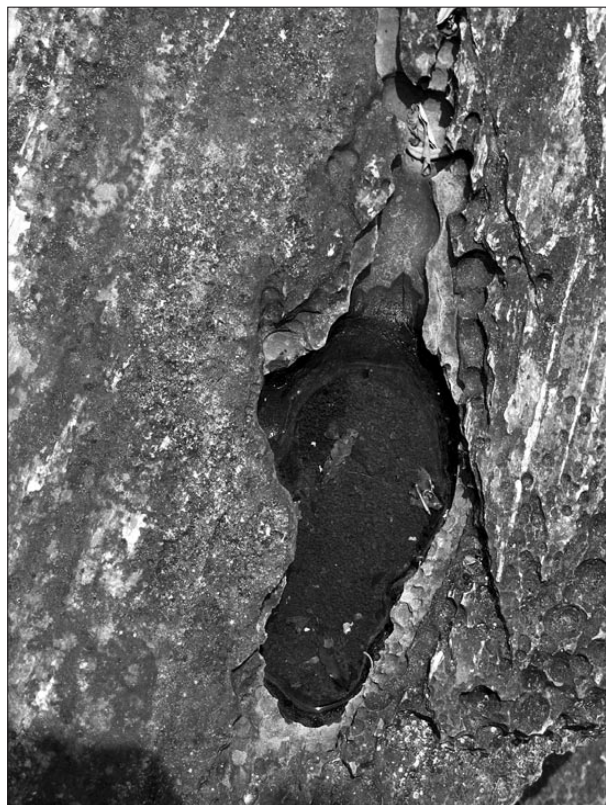
Fig. 9: Solution cup.

part of the pockets and their depth reach up to 0.5 meters. Due to gravity watering, the axes of the pockets are vertical. Composite pockets develop when several in-