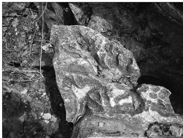
Fig. 6: Subsoil channels.

times) of a scanning electron microscope reveals tiny fracturing that is the consequence of the more rapid dissolving of rock along weak spots in the rock at the contact between the diverse particles that compose it (Slabe 1994). The smoothness or roughness of the rock is influenced by its composition and fracturing. Here, the lamination of the rock and dissection along contacts is a particularly important factor.