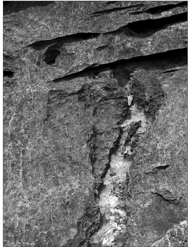
Fig. 8: Wall channel.

permeable contacts in the rock. The vertical jaggedness of the walls (Fig. 3-7) is the consequence of the water converging on them from the dense network of subsoil channels on the tops of the karren and inter-laminae tubes ending on the walls at several levels. The walls are therefore crisscrossed by a network of semicircular vertical channels, mostly one to twenty centimeters wide and only a few dozen centimeters long, usually extending to a lower-lying network. From here on, the wall is further