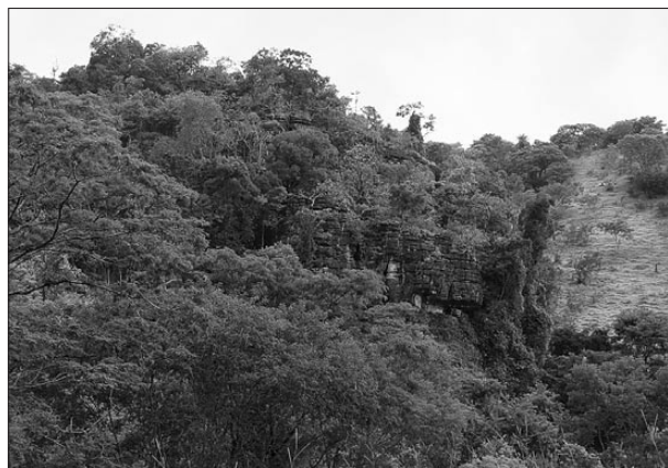
Fig. 4: Karren wall.

channels that reach the edge of the top. On overhanging walls these widen downwards in a half-bell shape. A web of channels can cover the smaller tops entirely (Fig. 6), which indicates that the water flows over the