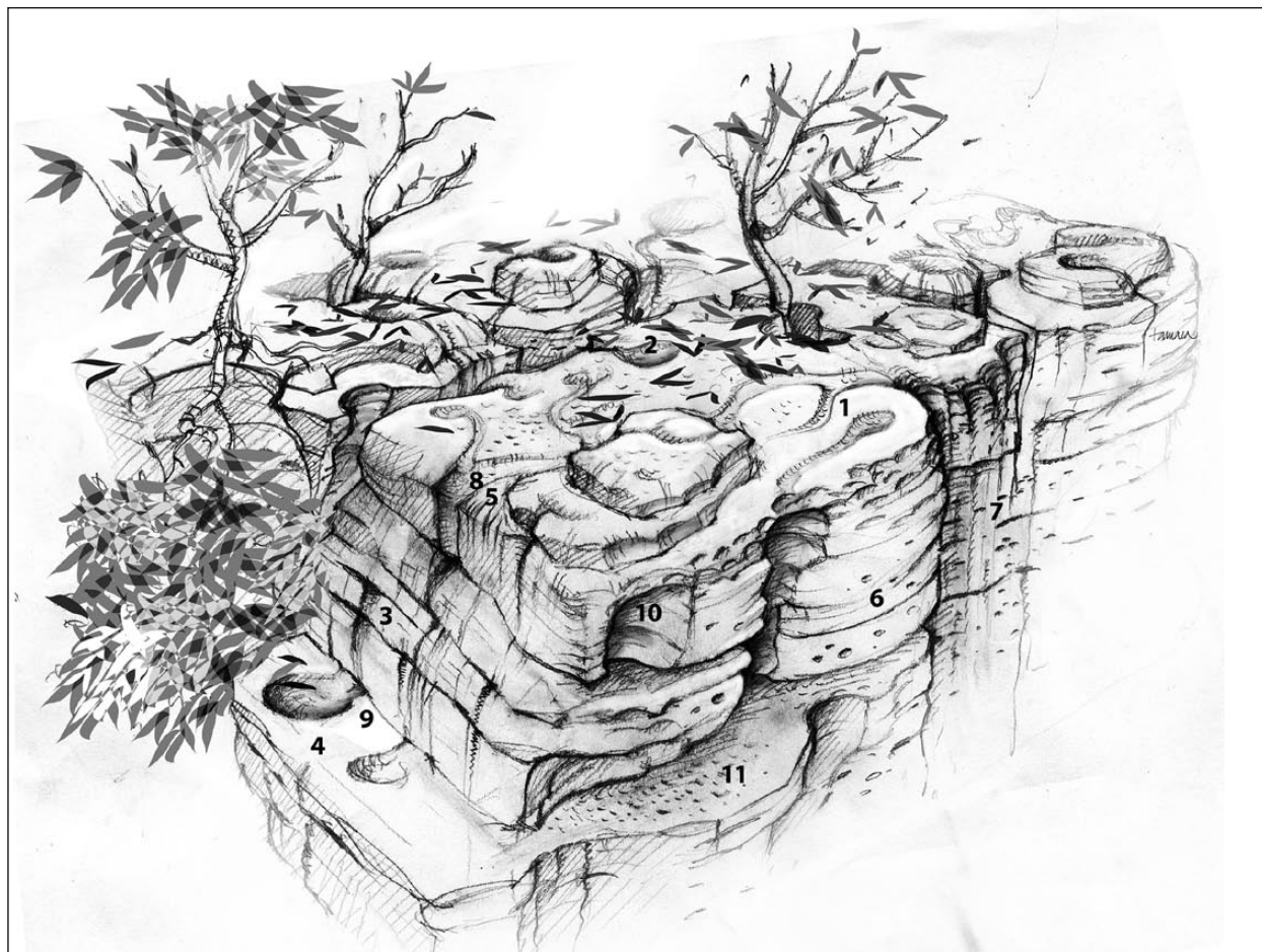
Fig. 3: Karren on laminated rock: 3-1. subsoils channel, 3-2. subsoil cup, 3-3. network of tubes along contact, 3-4. subsoil cup or kame-nitza, 3-5. rain flutes, 3-6. notches along contacts, 3-7. vertical jaggedness, 8. half-funnel shaped notch at the end of channels, 9. channel from the inter-laminae tube, 10. ceiling pocket, 11. pits, formed by water trickles.