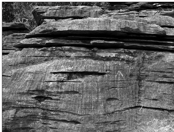
Fig. 10: Rain flutes.

flows of water are involved in the process of their formation. Franke (1975) determined that the diameter of pockets is proportional to the volume and aggressiveness of the inflowing water. With a larger inflow, the diameter increases, and with greater corrosive power the increase in diameter is less rapid and the pocket deepens faster. Dreybrodt & Franke (1994) determined that when