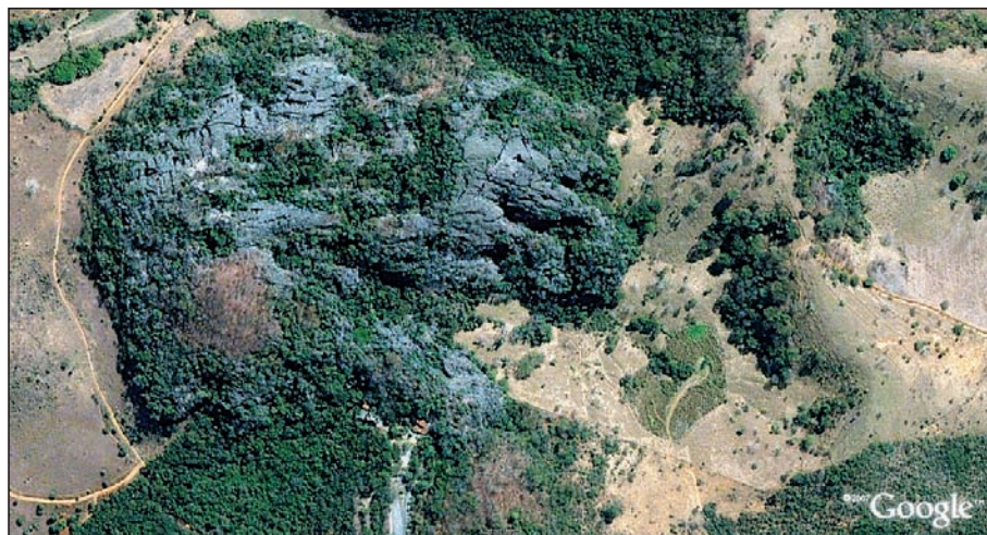
Fig. 2: Lagoa Santa karren (Google Earth 2010).

record from the last period of 30 years. From October to March, the average temperature is around 29.6 °C. Relative humidity ranges around 60% and 77% during the driest and most humid months respectively. The average annual precipitation is around 1,380 mm. The dry period extends for about five months from May through September with less than 7% of the annual precipitation, characteristic of a typical tropical precipitation regime with a great concentration of rain in summer and drier winters (Patrus 1996).