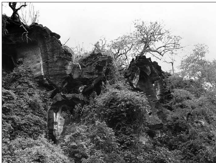
Fig. 11: Ceiling pockets.

flows of water are involved in the process of their formation. Franke (1975) determined that the diameter of pockets is proportional to the volume and aggressiveness of the inflowing water. With a larger inflow, the diameter increases, and with greater corrosive power the increase in diameter is less rapid and the pocket deepens faster. Dreybrodt & Franke (1994) determined that when