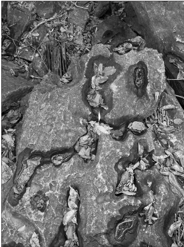
Fig. 7: Subsoil cups.

Rain flutes (Figs. 3-5 & 10; rillenkarrren, Ford & Williams 2007, p. 326; Lundberg & Ginés 2009, p. 185) are found on denuded sections of inclined walls, and rain pits (Lundberg & Ginés 2009, p. 169) and solution pans (kamenitzas, Cucchi 2009, p. 139) on gently sloping areas. Due to occasional filling with weathered debris, parts of the kar-