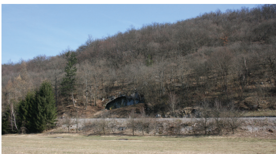
Figure 1: Betalov spodmol.