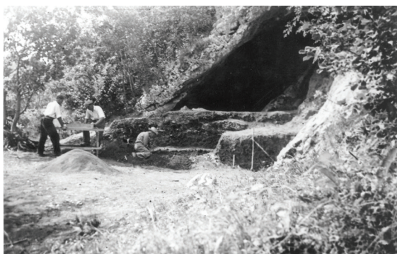
Figure 2: Anelli's excavations at Betalov spodmol.

1 Later, the cave's cadastre number was changed to JZS 473.