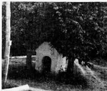
Kapelica Matere Božje pri Belivodi

Št. 64, Kansas City, Kans. Zaradi hude zime in velikega snega, nismo imele seje v jan. Prosim pa, da zato sedaj pridete v večjem številu, da bomo kaj koristnega ukrenile za podr. in Zvezo.