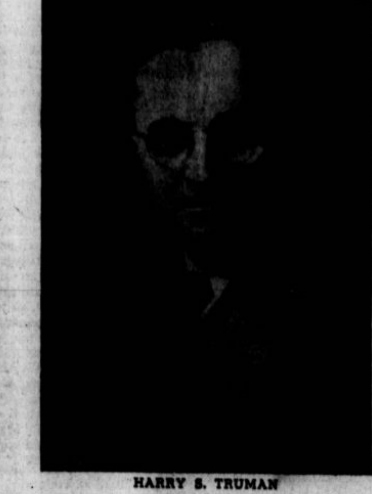
HARRY S. TRUMAN