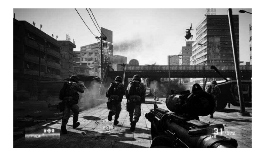
Figure 1: Image captured from Battlefield

Clash Royale I: The game starts by dealing a deck of different cards to each player. The cards are grouped into four categories: common, rare, epic and legendary. Players of this game from around the world are divided into clans with a maximum of 50 players. One clan may include your peers from class or another school. Naturally, a group may also include players who have never met before. They compete one-on-one against each other in order to win as many trophies as possible and increase the rank of the clan on a clan scoreboard. All communication is in English, so players who do not normally speak English are able to learn new words and phrases without consciously knowing it.