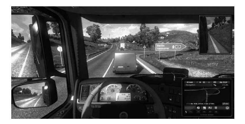
Figure 3: Image capture from Euro Truck Simulator 2

delivery. The player can choose to be employed by a company or to run his or her own company with his or her own employees. The player has a choice of cargo and destinations.