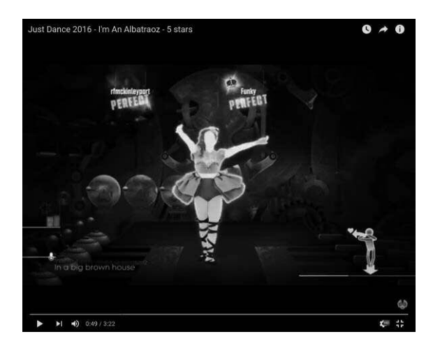
Figure 4: Image capture from the game Just Dance

support for your smartphone, which then functions as the motion sensor remote when connected to the game device. Scores are given according to grades: for each move, the player can receive OK, GOOD or PERFECT, and if the player gets several perfect moves in a row, he or she is graded STAR. Apart from single player mode, the game can support a group of players or a group party session.