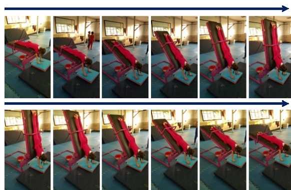
Figure 2. the handstand training using a researcher-made device.

All data analysis was conducted using SPSS statistics computing program version 22 (SPSS Inc. _ 1993–2007). Descriptive statistics (Means \pm SD) for all variables were calculated. Next, data were analyzed with Shapiro-Wilk normality tests to ensure normality, and student Independent T-test, MANOVA, and Mann-Whitney tests were used to compare the differences. Differences were considered statistically significant at the p \leq 0.05 levels.