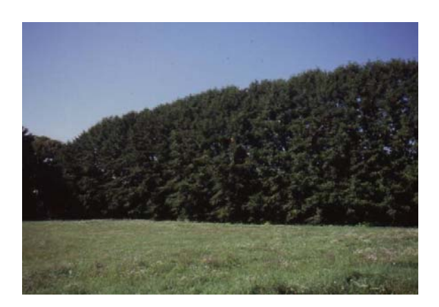
Figure 1. Vertical vegetational plane ( Pterocarya fraxinifolia , BF, Ljubljana)

The properties of the materials by means of which a plane is composed are uniformity, homogeneity, coherency (Ogrin, 1996). Significant characteristics of the plants that form horizontal planes, are low variability within one species, equalized texture of shoots, leaves, blooms, and regular growth.