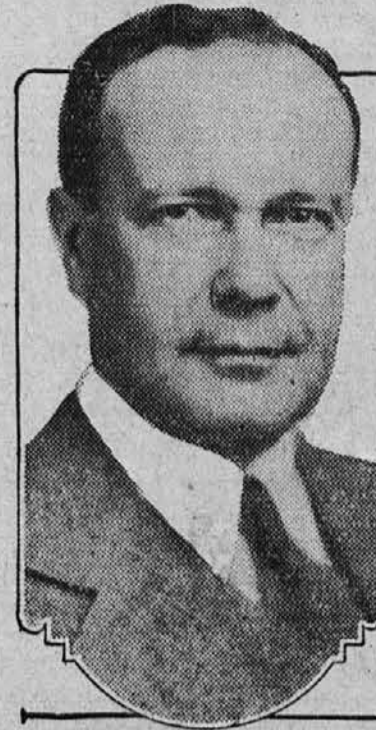
ROBERT J. BULKLEY

Pictured above is Robert J. Bulkley, U. S. senator from Ohio, who will address the local community at the Slovenian National Home next Monday evening in behalf of Franklin D. Roosevelt and the Democratic state and county slates. Bulkley has always been extremely popular in this community and can feel assured of a tremendous ovation when he takes the speaker's platform. Incidentally, all straw votes show that Ohio's "wet" senator is just as popular all over the state.