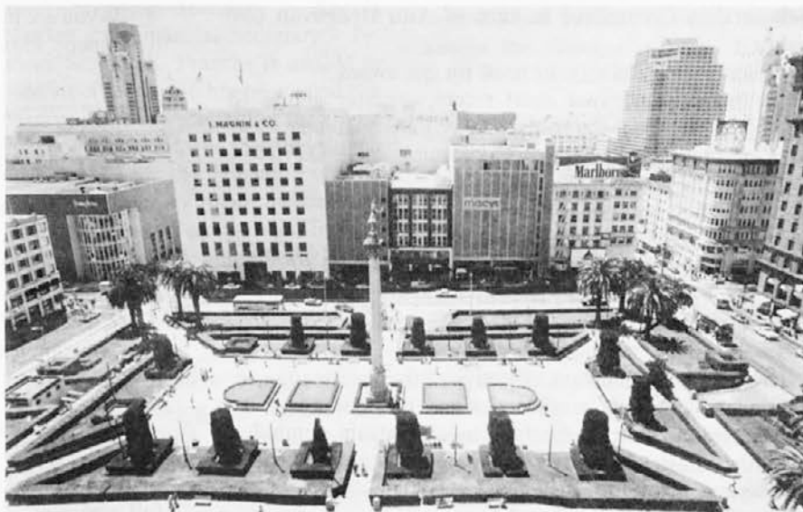
UNION SQUARE, the hub of downtown San Francisco

Although its oldest building--the Woolen Mill--dates back to 1864 (Civil War uniforms were made there), Ghirardelli Square is renowned for its years as a chocolate factory. The Domingo Ghirardelli family produced chocolate here from 1893 until the early 1960s. Some of the original vats and ovens are still in operation at the Ghirardelli Chocolate Manufactory on the plaza level of the Clock Tower. Ghirardelli Square is a favorite spot for visitors and San Franciscans alike. In addition to fabulous views of the Bay, it boasts more than 70 shops and award-winning restaurants. The Square's West Plaza stage and two-tiered bandstand regularly host a variety of free entertainment. (A cable car ride away from the Canterbury Hotel)