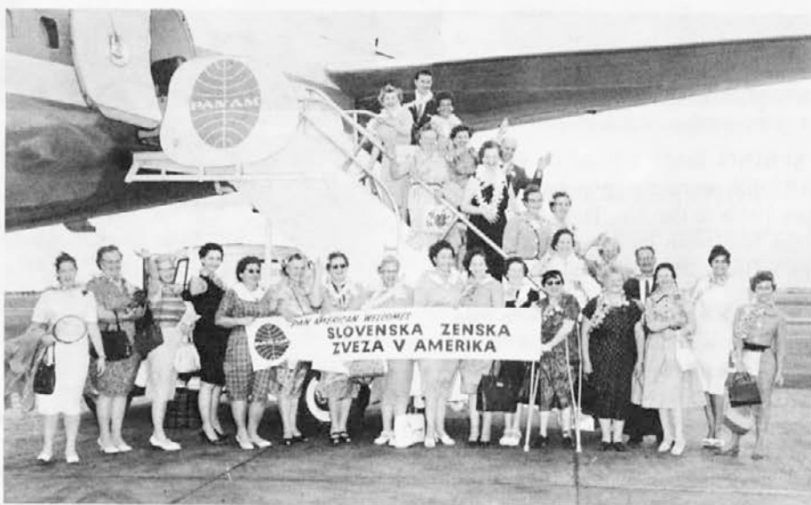
This picture was featured on a 1961 cover of ZARJA.