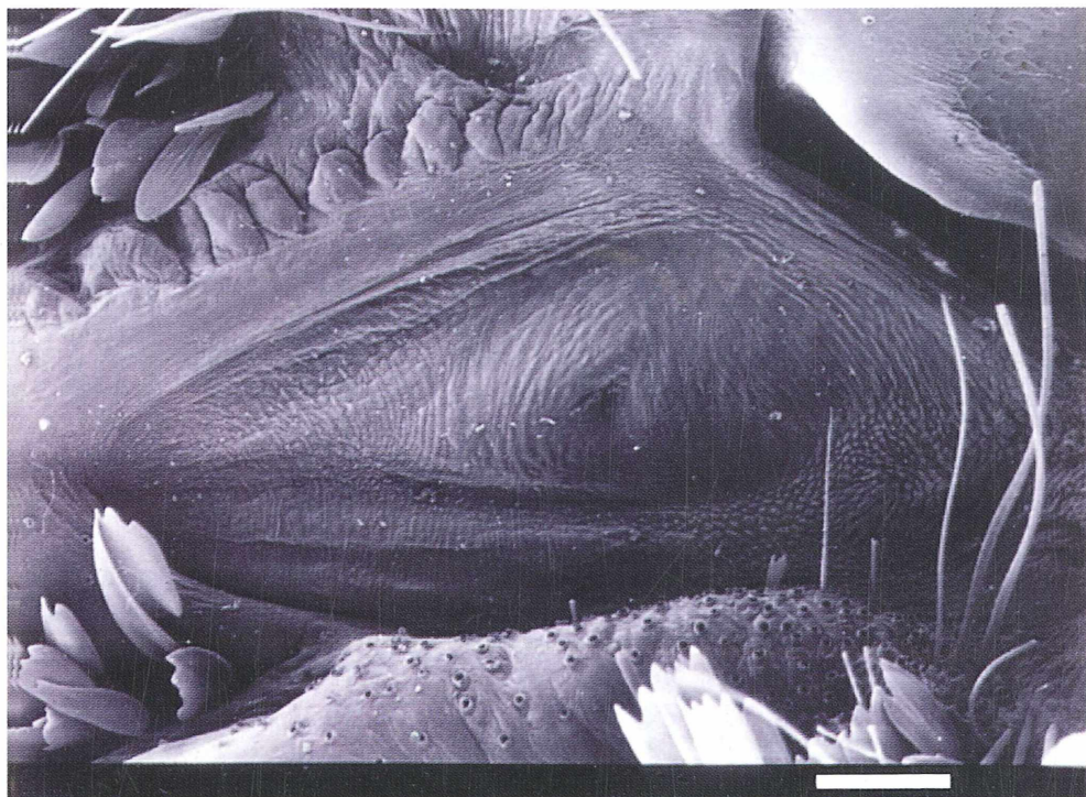
Fig. 3: Scanning electron micrograph show the morphology of the tympanal organ in E. manto . The involution of the tympanum is the point of insertion of the chordotonal organ (marker: 100 \mu m).