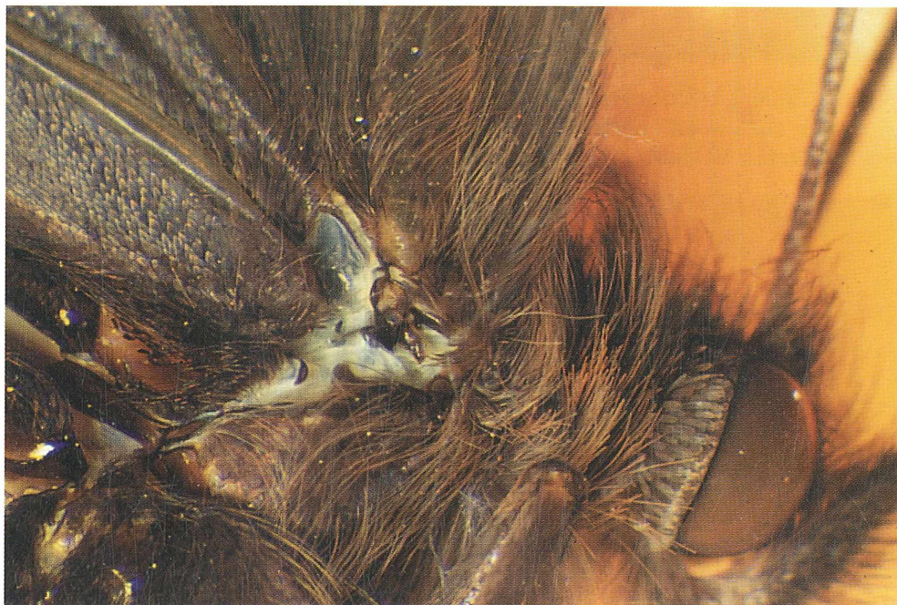
Fig. 2: The position of the tympanal organ at the base of the front wing in Erebia manto .