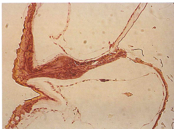
Fig. 4: Vertical section through the middle of the tympanal organ in E. manto (left = dorsal; right = ventral).

Authors' address/Naslov avtorjev Darja RIBARIČ, Matija GOGALA Prirodoslovni muzej Slovenije Prešernova 20, p.p. 290 SI-1001 Ljubljana, Slovenia