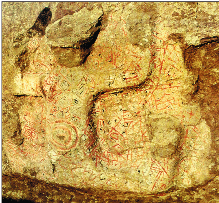
Fig. 3. Splayed figure in shrine VII. 23 (Mellaart 1967.Pl. VII).

As already mentioned, the heads and hands of the splayed plaster examples are always missing, so it was not easy to say whether the figures were humans or animals. It raises new