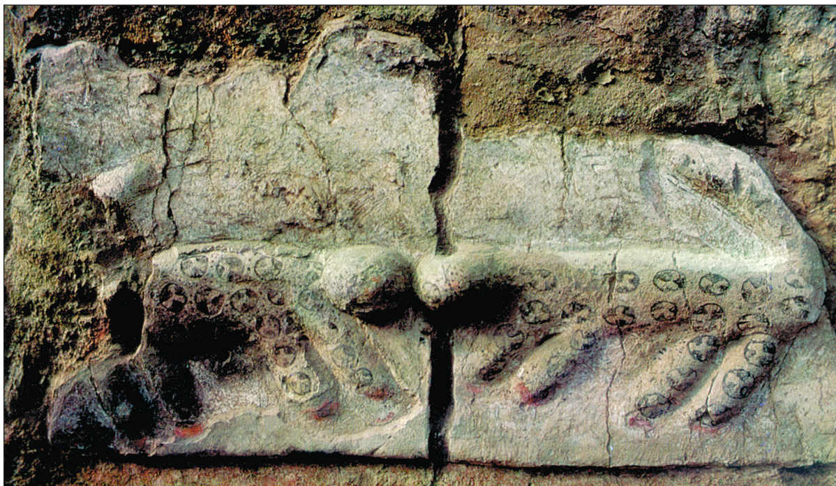
Fig. 2. Leopard reliefs (Mellaart 1967.Pl. VI)

Although leopards appear repeatedly in Çatalhöyük art, part of a specimen was only finally found in 2006: