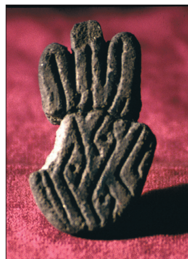
Fig. 5. Paw-shaped stamp seal.

The context of the bear stamp is also noteworthy regarding its deposition. It was at the center of the building deposit, equidistant from the walls and the northern edge of the hearth. It was placed face down, with head on house fill (Space 54) that was probably a backfill below the upper phase of the overlying building (Fig. 6). So the seal does not seem to have been deposited accidentally, but seems to have been left as a votive object before the abandonment of the space (space 54). It is clearly identi-