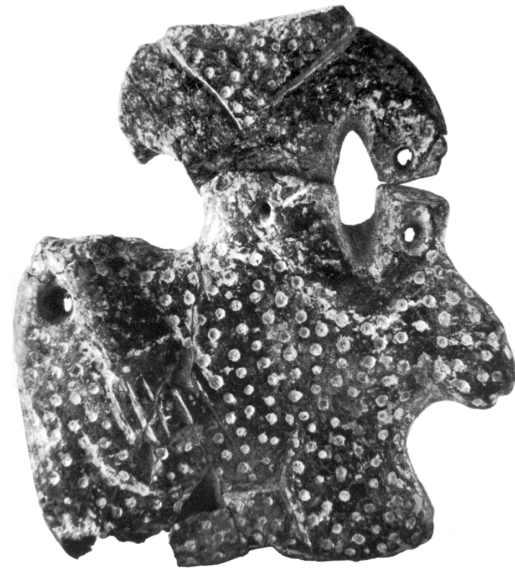
Fig. 7. 'Master of the animals', limestone figurine of a woman on a leopard (Mellaart 1967.Pl. 75)

❶ According to Russel and Meece (2006.215), they are generally animals, because none of them have any indication of any gender, in contrast to some figurines and painted figurines. Moreover, the upturned legs make a position physically impossible for humans. The placement of the limbs rather suggests bears or some other some quadruped animals. More-