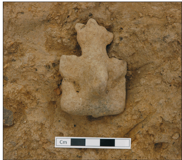
Fig. 6. In-situ position of bear seal (11 652.x1) on house fill of Building 44. on-line http://www.catalhoyuk.com/archive_reports/2005/ar05_14.html (Fig. 53).

The evidence from the stamp seals and probable splayed figures testify that the bear cult was another important ritual figure, as well as the leopard and bull cults throughout many levels among the Çatalhöyük Neolithic community. On the other hand, the cult of the bear was already a deeply rooted belief from the Middle Paleolithic (and until recent peoples in the Arctic). The first evidence of a bear cult is observed at a Middle Paleolithic site at Régourdou. Régourdou constitutes a case for some kind of bear-centered animal cult some 60 000–70 000 years ago (Hayden 2005). Ethnographically, bear cults are rather common in cold climates, from the Northern Coast to Finland and Siberia. Lajoux (2002) and Bonifay (2002) have drawn attention to the frequent importance of the bear as a symbol of death and resurrection (because of its hibernation and reemergence in spring), making it apt for rituals. These