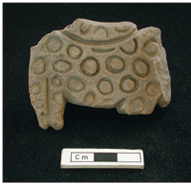
Fig. 1. Leopard seal (Çatalhöyük Research Project Archive).