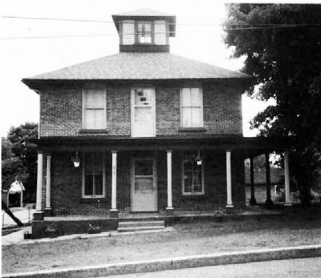
Left: The Baraga House, as it is known in historical archives. This is the house in which Bishop Frederic Baraga died on January 19, 1868. His room may be viewed now as it was then.