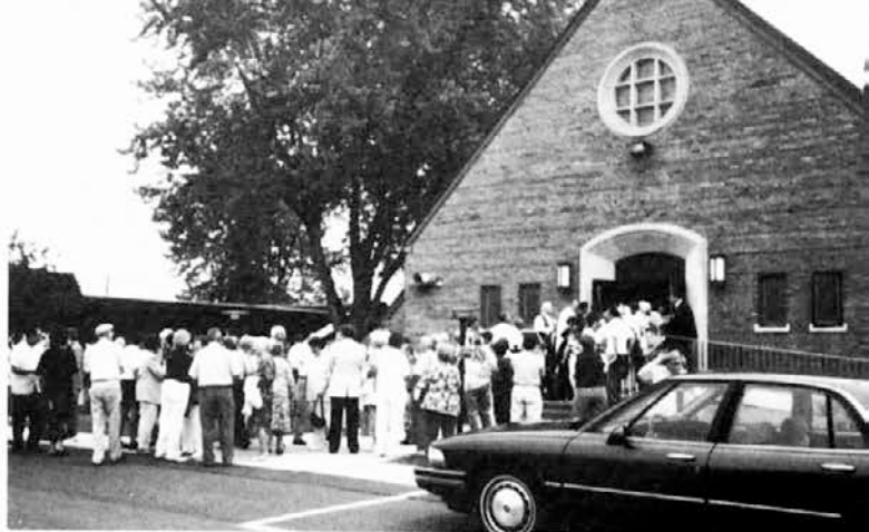
St. Elizabeth's Church, Duluth