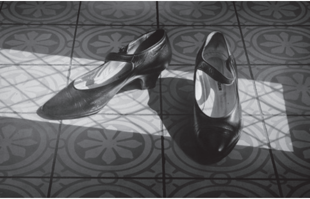
Jan Peter Tripp, Déclaration de guerre . Copyright © Jan Peter Tripp. Reprinted by permission of the artist (in "As Day and Night 91E, 185G).

Let us finally try to show that in the picture "La déclaration de guerre" measuring 370 by 220 centimeters and in which an elegant pair of ladies' shoes are to be seen on a tiled floor. The pale blue-natural white ornament of the tiles, the gray lines of the joints, the lozenge-net from a leaden glass window cast by sunlight onto the picture's middle section, in which the black shoes stand between two shadow areas, all this makes a geometric pattern of a complexity not to be described in words. ("Like Day and Night" 91E)