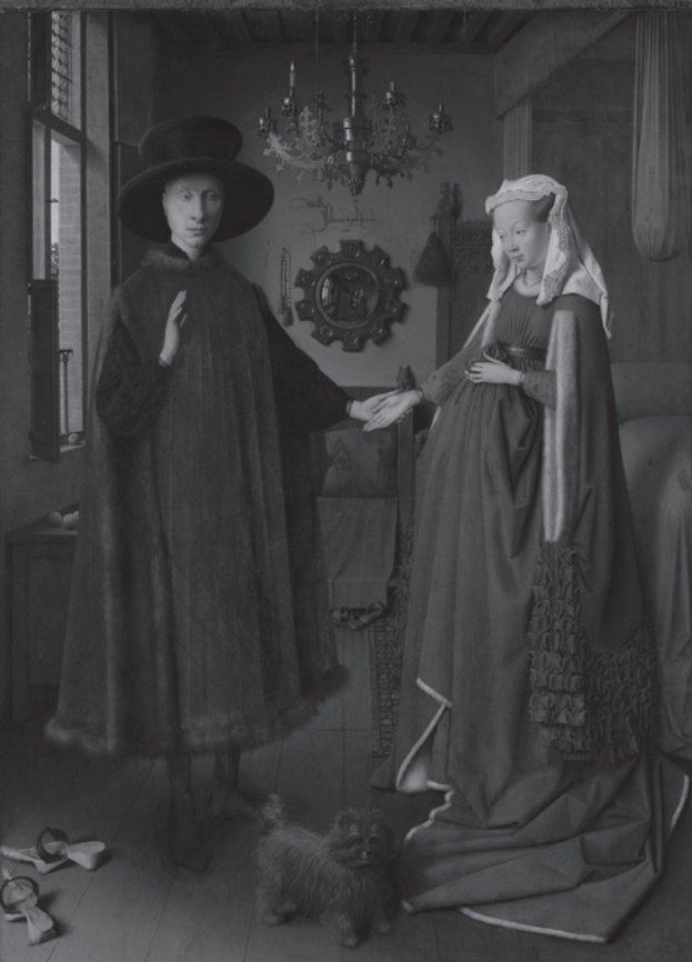
Jan van Eyck, The Arnolfini Portrait .

tion? Isn't it this that contemplating the painting of van Eyck (and reading the narrator's ostentatiously faulty description of it) tells us?