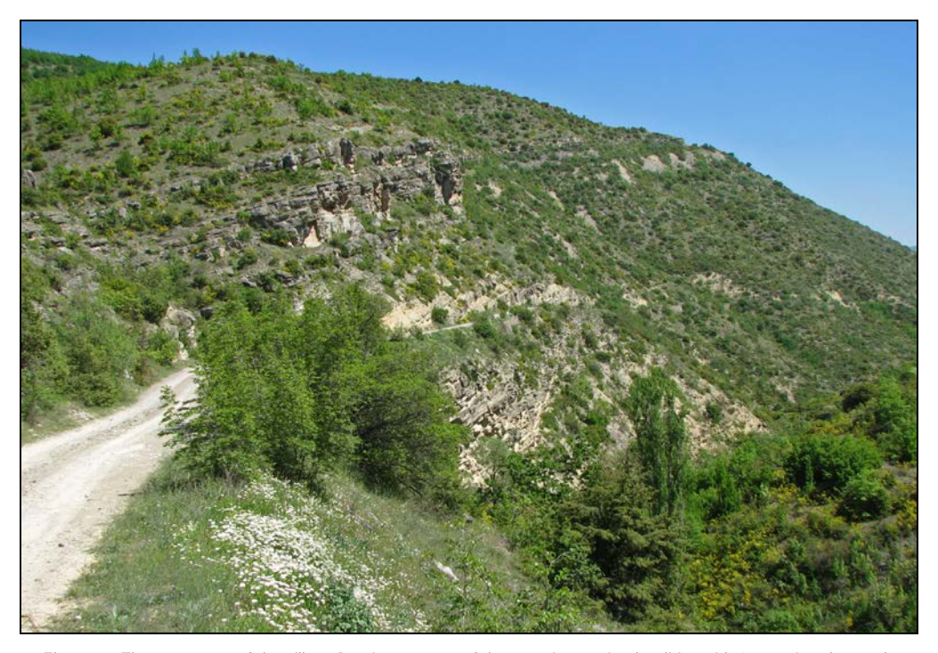
Figure 4. The gorge east of the village Besvica was one of the most interesting localities with 37 species observed, including rare species like: Plebejus sephirus, Tarucus balkanicus, Melitaea ornata, Carcharodus orientalis , and Erynnis marloyi.

Slika 4. Soteska vzhodno od vasi Besvica je bila ena izmed najbolj zanimivih obiskanih lokacij. Tu smo našli 37 vrst metuljev, med njimi tudi redke vrste: Plebejus sephirus, Tarucus balkanicus, Melitaea ornata, Carcharodus orientalis in Erynnis marloyi.