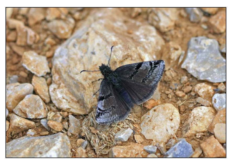
Figure 2. The Inky Skipper ( Erynnis marloyi ), a rare species in Macedonia, was found at two sites during the survey. Slika 2. Sivček vrste Erynnis marloyi je v Makedoniji redka vrsta. Našli smo ga na dveh novih lokacijah.