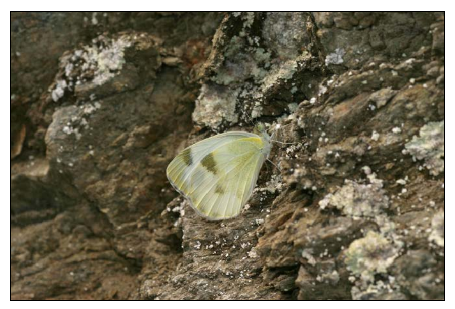
Figure 3. The Krueper's Small White ( Pieris krueperi ) has been found for the first time in the lower part of the Vardar Valley. Slika 3. Krueperjev belin ( Pieris krueperi ) je bil prvič najden v spodnjem delu doline reke Vardar.