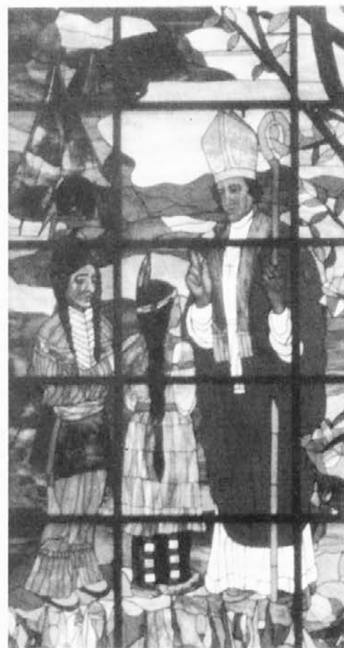
+ Frederic Baraga 1797 - 1868