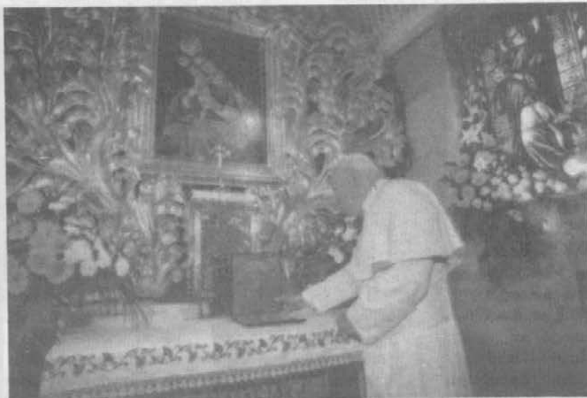
The Holy Father at Marija Pomagaj's altar at Brezje Papežev rožni venec Mariji Pomagaj