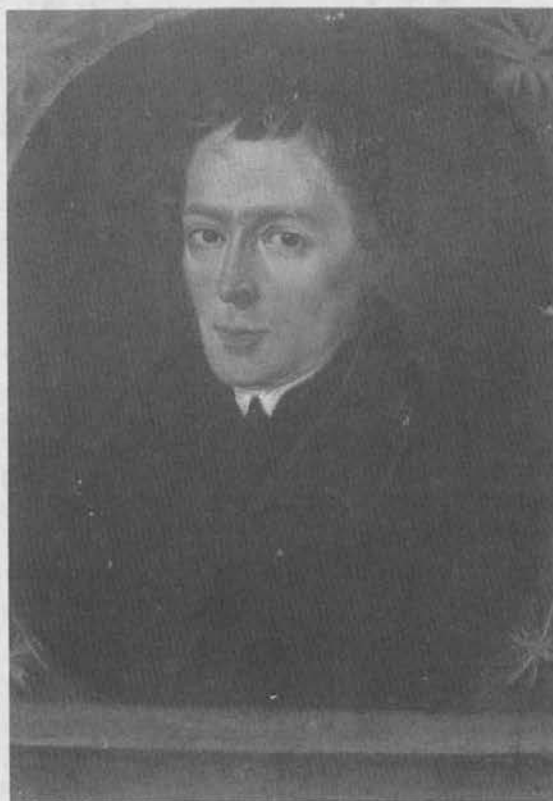
Avtoportret FRIDERIK BARAGA KOT KAPLAN * 29.6.1797 †19.1.1868