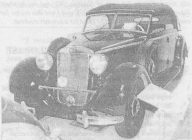
This 1938 Horch 951A was driven by the character of Oskar Schindler in the film "Schindler's List." It is part of a museum collection in Slovenia.