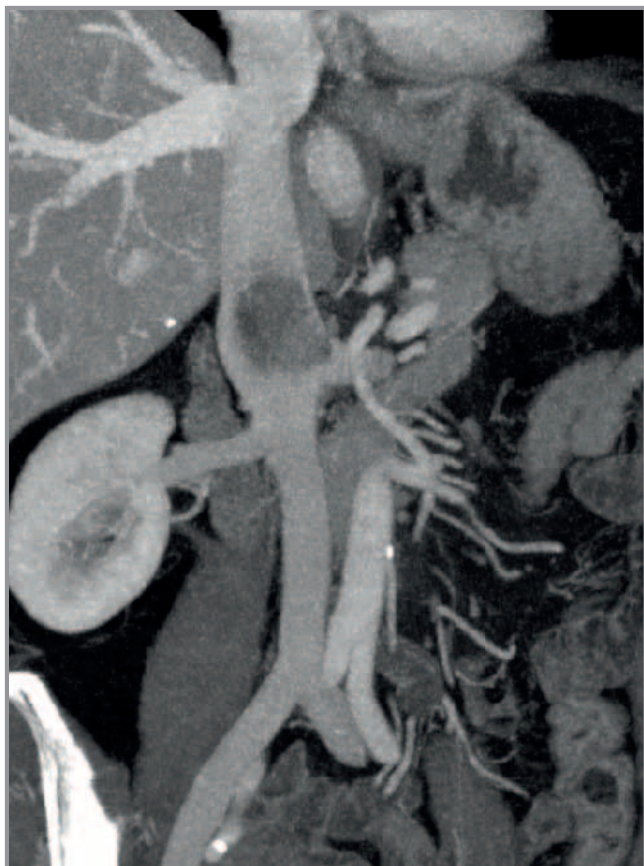
Figure 1. CT image of the growth - height measured in coronal section was 42 mm, volume 15 cm 3 . The influx of the left and right renal vein is also visible.

The preoperative CT scan, coupled with a magnetic resonance imaging (MRI) scan, confirmed that the tumor, presumably a leiomyosarcoma, was located within the IVC. Due to the location of the tumor in segment II of the IVC and involvement of the left renal vein, a radical resection with vascular prosthetic reconstruction was chosen.