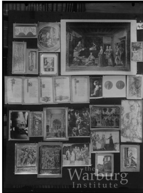
Figure 1: Aby Warburg, The Mnemosyne Atlas , Panel 46, 1929, The Warburg Institute, London, UK 4 .

London University. In 1924, after undergoing the treatments for psychological illness in Swiss clinics, Warburg begun creating Mnemosyne Atlas . He died in 1924, leaving this large and complexly envisioned project uncompleted.