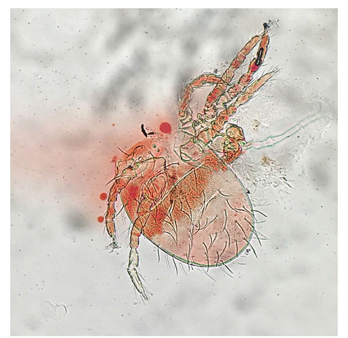
Figure 3 | Microscopy of Trombicula autumnalis, 40× magnification.

human. For humans, contact with the mite usually occurs by walking through low vegetation or grass. Therefore, lesions are often found on the legs and ankles, especially on thinner skin. Because children frequently play on the ground, they can present with lesions anywhere on the skin. The larva attaches to the skin with its mouth, injects keratolytic substances into the skin, and feeds itself with the resulting "cellular soup" (5). The host response is largely caused by sensitization to the injected saliva. The intensity of the response may vary, ranging from a slightly irritable red erythema to wheals with papules or papulovesicles matched with intense itch arising between 3 and 6 h after exposure, with a peak after 12 to 24 h. In extreme cases, regional adenitis may occur (6). The larvae feed for roughly 2 to 5 days to a maximum of 10 days. Afterwards, they fall onto the ground, where they turn into eightlegged nymphs and enter a quiescent phase until they become adults. The adult and nymph mites are soil-dwelling predators, which nourish themselves only on other arthropods and their eggs, and they are harmless to humans.