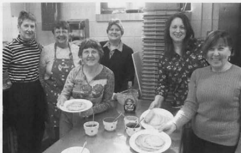
Branch 99 Palancinke class

815.729.9787. Members and a friend or spouse are welcome. Come join us for some Slovenian games, entertainment and an afternoon of fun!