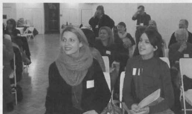
Trivial Pursuit Slovenian Style: Team A