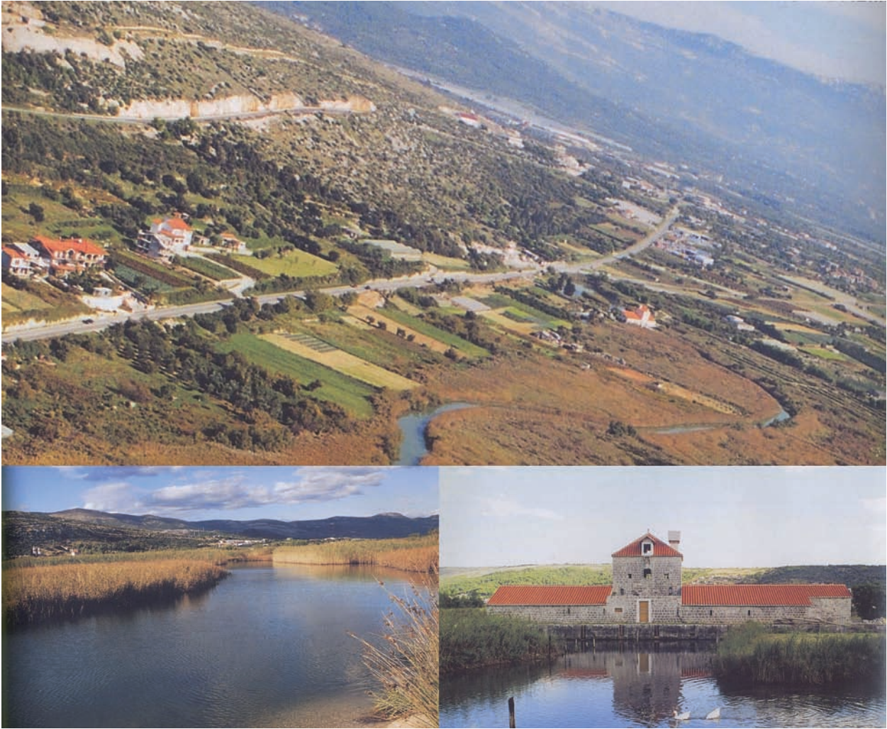
Fig.2: Pantan swamp area and Pantan Mill

made. All above mentioned actions are presenting an example of bad watershed management as well as bad care of reservation area and cultural heritage. All activities in watershed area of Pantan spring and Pantan reservation itself led to the significant devastation of this valuable natural and cultural-historical reservation.