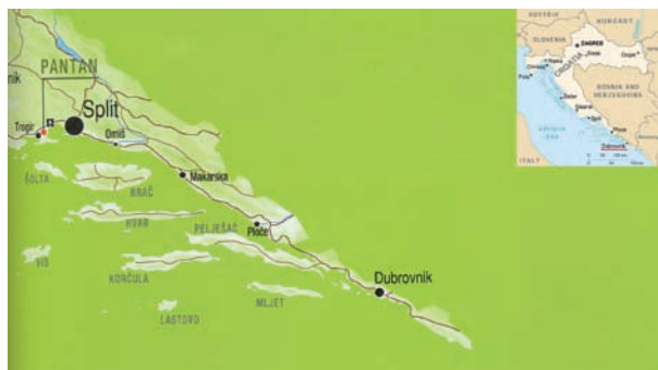
Fig. 1: Pantan area location

From the ecological standpoint and according to the Environmental Protection Law, Pantan area presents unique swamp area in wide region and it is evaluated as a highly valuable environment. It should be mentioned that this area except natural values, has significant cul-