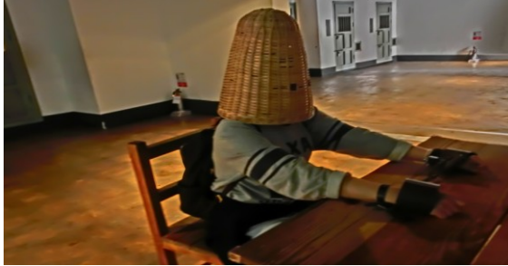
Fig. 7: Fingernail torture

wicker basket, arms extended and manacled at the wrists, reenacting how the fingernail torture was administered.