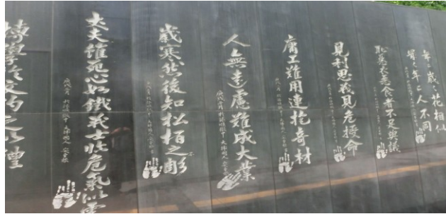
Fig. 5: Ahn’s distinctive handprints and calligraphy adjacent to entrance ramp

religious piety, a remarkable turn of events given that he had killed one of Japan’s national heroes. One of Ahn’s own poems on display reads: “Every year the same flowers bloom, but the people change with the passing of time” (年年歲歲花相以、歲歲年々人不同).