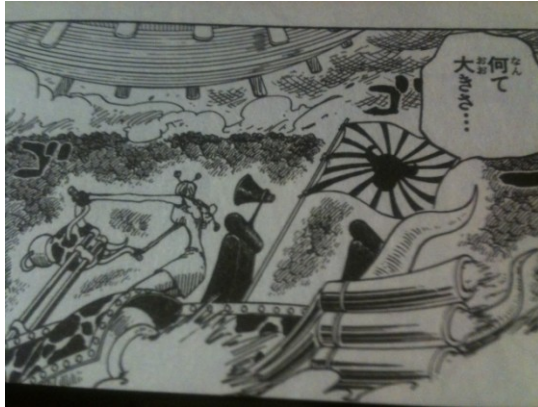
Fig. 1: Enemy vessel with Rising Sun-esque flag approaching the pirate’s ship. 2

100,000 visitors in the first week alone. The promotional campaign emblazoned the Taipei metro in One Piece cartoons, something unthinkable in Seoul’s subway given the prevailing sensitivities about the two nations shared history. After all, it wasn’t until 1998 that South Korea began to incrementally ease the blanket ban on Japanese cultural products that was imposed following independence in 1945. (Trends in Japan 2014) In fact, satellite broadcasts and the Internet had facilitated considerable cultural seepage before then, and Korean translations of Japanese manga were widely available and extremely popular, a grassroots rejection of state policy that helped propel the state-sanctioned cultural opening.