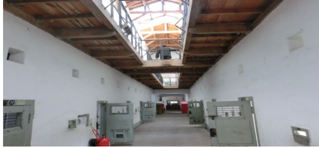
Fig. 9: Cell-block where post-independence, pro-democracy political prisoners were held

“harsh colonial rule, making Koreans fall into a state of slavery and frantically trying to liquidate Korean culture and language.” It was an “incessant struggle” in which “the whole of Korea” participated, except for the many collaborators. A display about the “heroic struggle” notes that activists targeted Japanese and pro-Japanese Koreans, complicating the valorous narrative with collaboration.