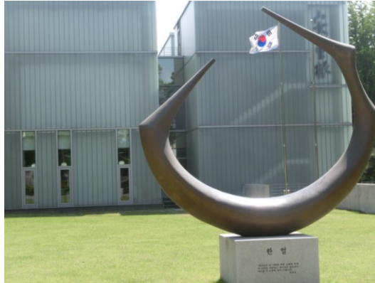
Fig. 4: Ahn Jung-geun Memorial Hall

1910. Ahn was executed on March 26, 1910 before completing his “A Treatise on Peace in the East”, a call for regional solidarity to resist western imperialism.