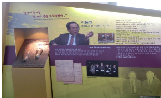
Fig. 10: Cell-block with dioramas about ROK political prisoners

Although unacknowledged in the museum’s pamphlet, the museum has tackled the controversial use of the jail to incarcerate a new generation of dissidents by South Korea’s military regimes from the 1960s–1980s, thereby linking the pro-independence and pro-democracy struggles as well as the Japanese colonial and ROK military regimes. There are several cells on one corridor with displays featuring the stories of these post-independence political prisoners although after the 2010 renovations one can no longer see the messages these prisoners scratched onto the walls. One plaque explains that the prison was operated until 1987, where, “many democratization activists during the despotic regime after liberation were imprisoned, tortured and died.”