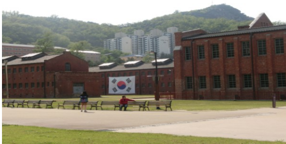
Fig. 8: Seodaemun Prison

Seodaemun was the largest of sixteen prisons built throughout the peninsula in 1908, “with the aim of suppressing the Korean patriots who were fighting to regain national sovereignty.” Renovated in 2010 for the centennial, the Seodaemun exhibits now convey more about the colonial era history, explaining for example that the space of the facility was expanded thirty-fold in the 1930s to accommodate the increased number of Korean independence activists. Established with a capacity for 500 prisoners, by the end of the colonial era Seodaemun housed 23,532. At that time there were 261 warders, Korean employees referred to as “faithful first-line puppets”; before the 2010 renovation the delicate topic of colonial collaborators was not raised. The museum explains that on average there were, “30 or so prisons in each city, making the country like a huge prison.”