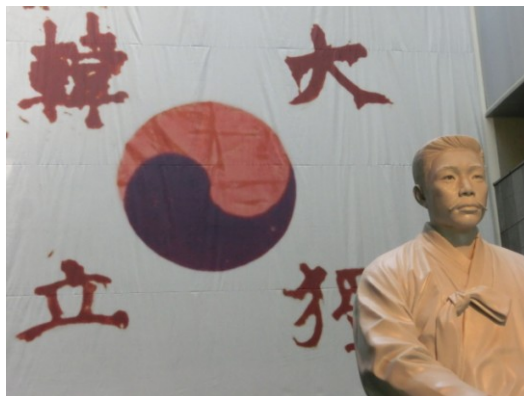
Fig. 6: Korean flag with Ahn’s bloody calligraphy declaring independence

Spread over three floors, the exhibits honor Ahn as a “patriotic martyr” and are brimming with nationalistic symbols, none more compelling than the massive Korean flag hanging behind Ahn’s statue in the spacious gallery close to the entrance, one that is festooned with his bloody calligraphy spelling out “Korean Independence”. There is a dramatized reenactment of the assassination and subsequent courtroom scene, the pistol used in the shooting, a replica of his severed ring finger and even an Ahn anime room. The museum highlights Ahn’s background and participation in the pro-independence movement against Japan as his Pan Asian thoughts are overshadowed by displays devoted to his patriotic activism and the assassination.