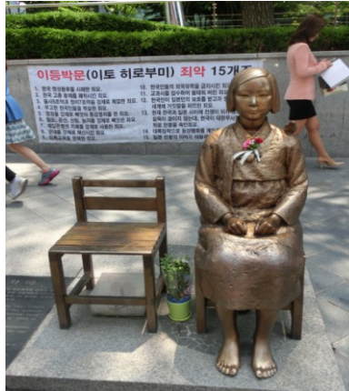
Fig. 3: Comfort Woman statue in Seoul across from Japanese Embassy

her gaze fixed eerily in silent rebuke across the street on the Japanese Embassy in Seoul. The bronze statue was unveiled in December 2011 to mark the 1,000 th weekly protest by a dwindling number of comfort women; only 55 remain alive as of mid-2014. Former President Lee Myung-bak (2008–13), South Korea's most pro-Japanese leader since Park Chung-hee, grew so exasperated with Japanese intransigence over the comfort women and forced labor issues that he threatened to place additional statues on the site.