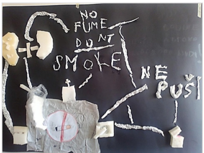
Figure 5 Figure 6

Reflection and analysis; remediation: During the practical work, the students were encouraged to proceed with the deliberation and analysis of their own works, as well as to think about their next steps. Analysis of the students' artwork through pre-prepared tasks and recording their answers to given tasks; reconstruction of the results – processing of the teaching content. Feedback from the surroundings. Verification of what has been adopted.