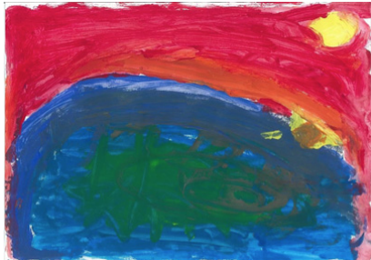
Figure 3 Figure 4

Reflection and analysis; remediation: During the practical work, the students were encouraged to proceed with the deliberation and analysis of their own works, as well as to think about their next steps. Analysis of the students' artwork through pre-prepared tasks and recording their answers to given tasks (recognition of emotion in the painting emerging from the combination of colours, idea recognition; discussion on expressing feelings in an acceptable way); reconstruction of the results – processing of the teaching content. Verification of what has been adopted.