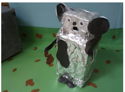
Figure 7 Figure 8

Deliberation and analysis; remediation: the students were expected to proceed with independent deliberation and analysis of their own works, and to implement the stages of the creative process. Analysis of the students' artwork and reconstruction of the results – processing of the teaching content. Verification of what has been adopted.