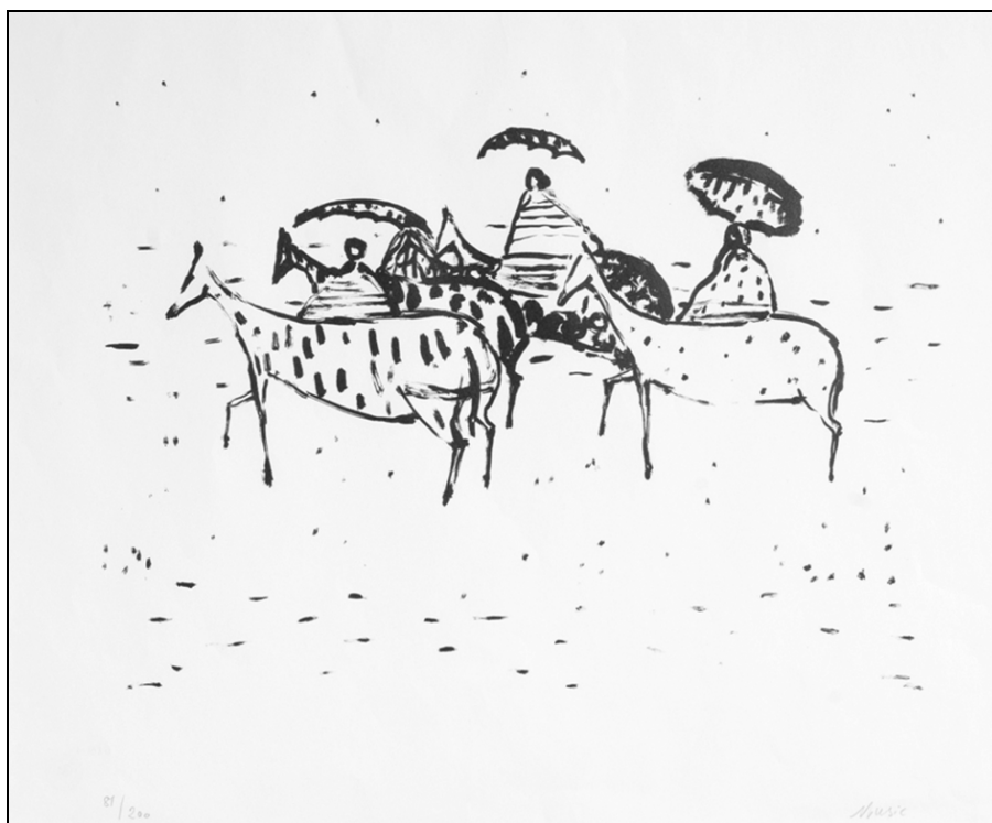
Fig. 4: Zoran Mušič, Small horses , 1949 (Regional Museum "Goriški muzej Kromberk – Nova Gorica"). Sl. 4: Zoran Mušič, Konjički , 1949 (Goriški muzej Kromberk – Nova Gorica).

years after 1950 the painter combined painting and graphic procedures into his new painting technique. He went beyond the classical separation of techniques, upgrading it into a new artistic creation by combining a wooden matrix as one phase in the process with other materials, such as ground Karstic limestone added to oil paints, as well as with sand and wood. Nevertheless, Spacal remains a great master of wood engraving at a time when most Slovenian artists of the so-called 'Ljubljana school of graphic art' followed masters from Paris. He opted for wood engraving technique which came to Trieste from Central Europe. One of the artists who brought the technique to Slovenia was also the avant-gardist August Černigoj. Spacal tried different art techniques, such as wall painting, mosaic, three-dimensional art objects, painted 'sculptures' which are in fact paintings rather than sculptures, but the greatest part of his opus consists of woodcuts. In spite of such rich range of the techniques he expressed himself in, Lojze Spacal remains known as a graphic artist adding haptic effects to his visual creations.