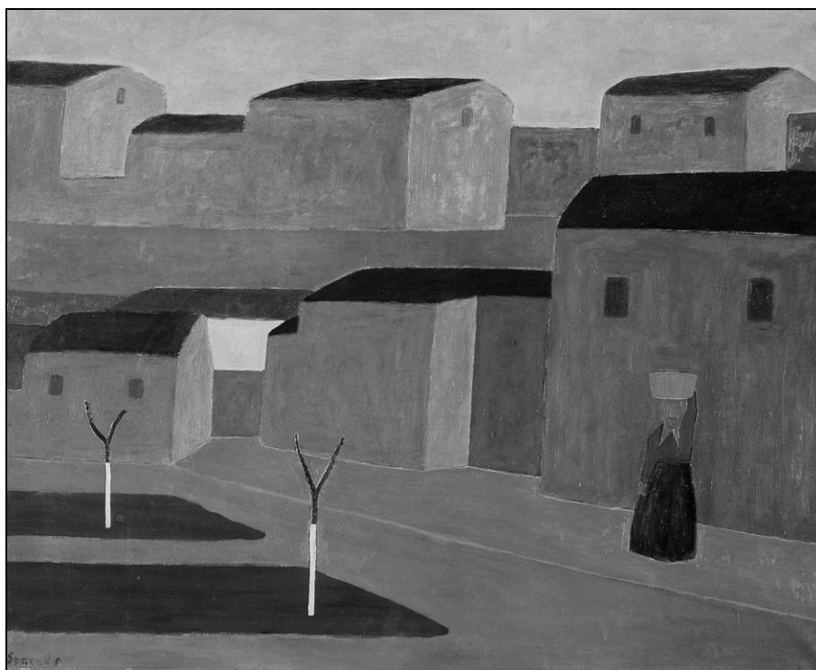
Fig. 1: Lojze Spacal, Evening on the Karst , 1951 (Badovinac Z. et al., 2000).

Sl. 1: Lojze Spacal, Večer na Krasu , 1951 (Badovinac Z. et al., 2000).