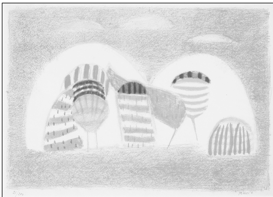
Fig. 3: Zoran Mušič, Motive from Dalmatia , 1955 (Regional Museum "Goriški muzej Kromberk – Nova Gorica"). Sl. 3: Zoran Mušič, Dalmatinski motiv , 1955 (Goriški muzej Kromberk – Nova Gorica).