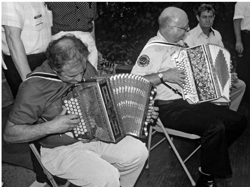
Figure 6: Jamming button-boxers in Fontana 1979.

“Polka” dances in the mid-1970s were frequent events throughout the year with different local orchestras. 16 An expansion of dance music repertoire and style of playing was established through “national” events. In 1979, the second far-west “SNPJ button-box contest” was sponsored by the Fontana Button Box Club, bringing together button-boxer accordionists from San Francisco, Chicago, and Cleveland, along with their differing polka dancing styles, not commonly seen earlier in Fontana. Jamming by musicians between all ages was everywhere and frequent in the weekend event. See Figure 6.