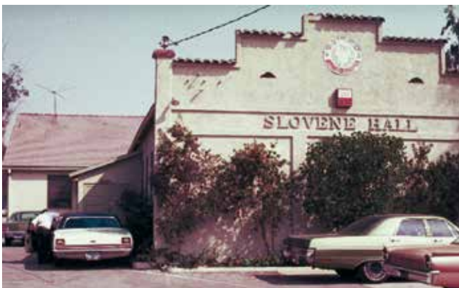
Figure 3: Hall in Fontana. Photo: E. I. Dunin, 1974.