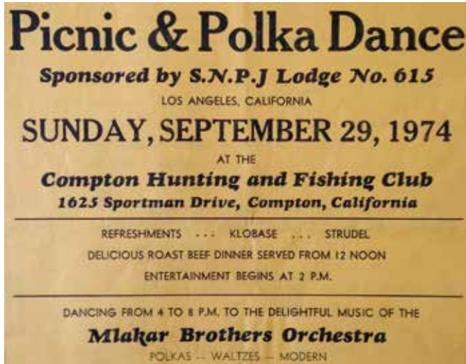
Figure 4: Compton poster 1974.