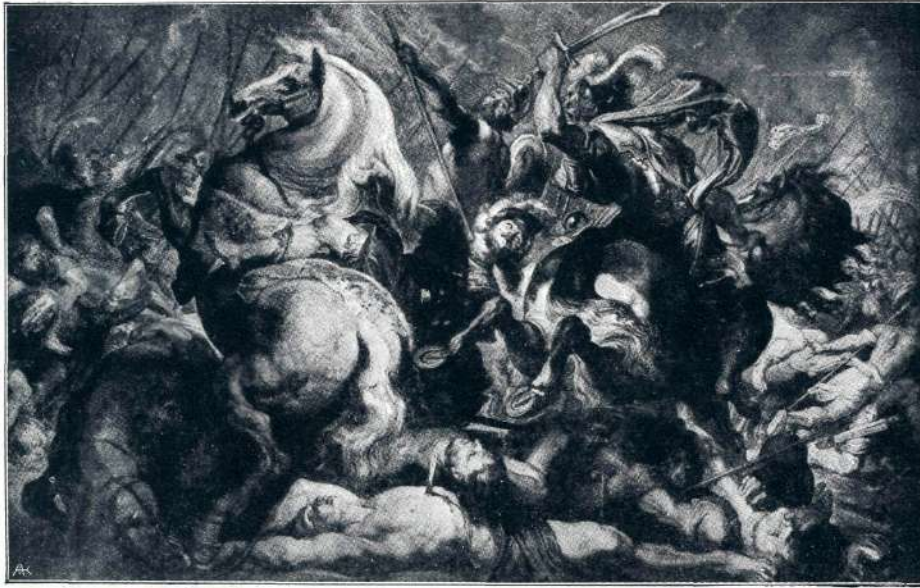
Peter Pavel Rubens: Smrt konzula Decija Musa.