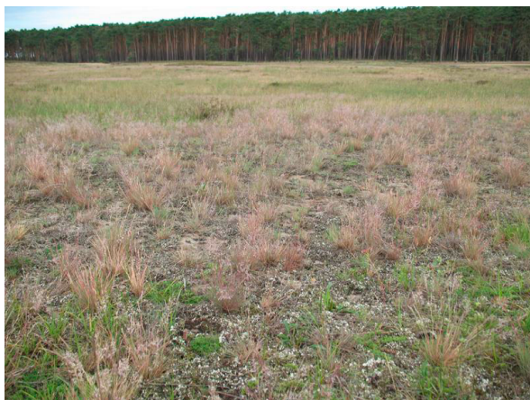
Figure 3: Corynephorus -grasslands in military range near Malacky, Križnica.

In the column D are associated data from military grounds and ranges in Moravia and Slovakia, where traditionally absent agronomical interventions, but large areas (several hectares) are under extensive disturbance due military activities. The number of psammophytes here is much