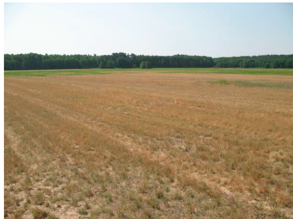
Figure 5: Abandoned field near Studienka with psammophyte vegetation.

22 years long succession on abandoned sandy fields in Denmark studied Deng (2001). According his observation the annual weeds fade out as first (during 3–5 years) and Jasione montana and Acetosella vulgaris became dominant, slowly supplement with persistent perennials such as Pilosella officinarum . The Corynephorus canescens grows