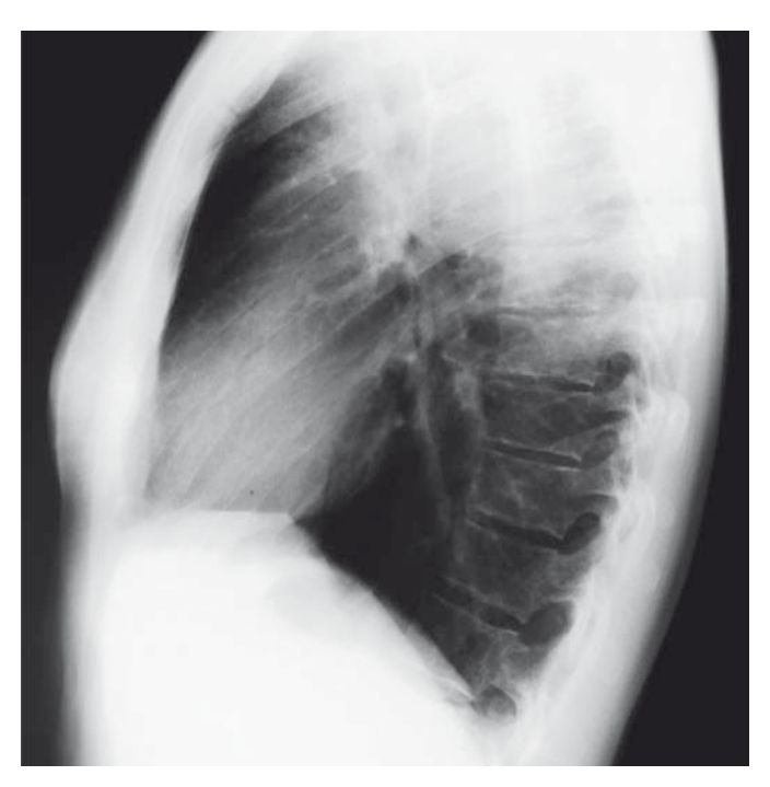
FIGURE 1A, B. Chest x - ray of aortic knob enlargement.

accident to the diagnosis of the pseudoaneurysm was 7 days in the last patient, and in the others it was between 2 months and 18 years (median 2.0 years). The diameter of the pseudoaneurysm was 4.5 to 9.2 cm (median 5.5 cm). In 7 (87.5%) injured patients the isthmus was involved, and in 1 (12.5%) case it was the descending thoracic aorta. In all 8