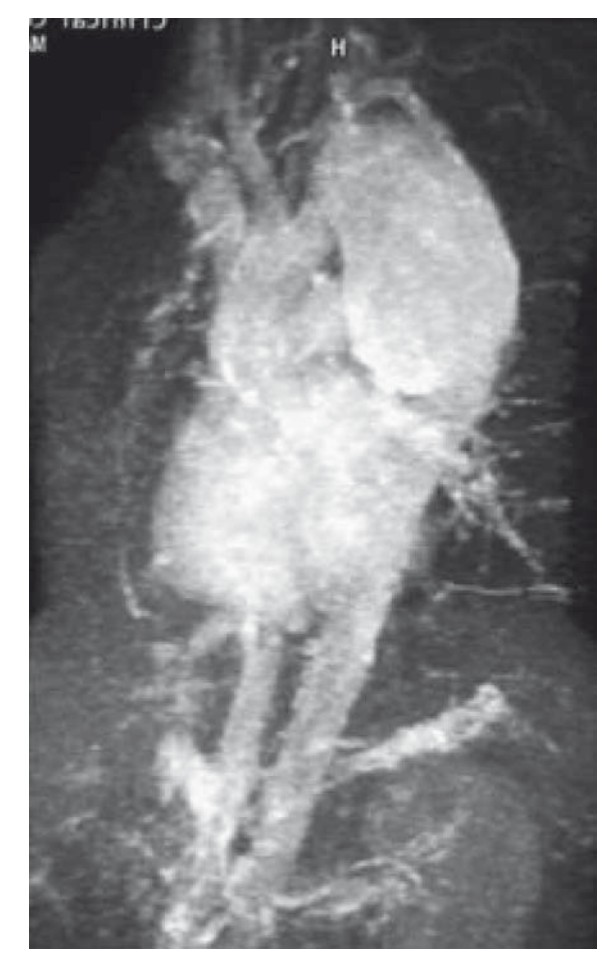
FIGURE 3. TOF MRI of posttraumatic pseudoaneurysm of the aortic isthmus.

of all cases. The interpretation of thoracic radiography in the patient in lying position is difficult. The extension and changes in the shape of the mediastinum on radiography are the most important signs of the aortic rupture and traumatic pseudoaneurysm of the aorta (Figure 1A, B). The most frequently radiographic signs reported are: abnormal shape of the aorta, shading of aortic-pulmonary window, left major bronchus shift downwards, deviation of trachea to the right from the medial line, shift of the nasogastric tubus, apical cap and border calcifications on the outer part of the mass, etc. Haematomas most commonly come from small arteries and veins in the mediastinum. Some 7.3% of patients have a normal mediastinum presented on the initial radiography, unless the traumatic pseudoaneurysm has been followed by a mediastinal haemorrhage, or haematoma, or the pseudoaneurysm has been very small, or it has been located in such manner as to keep the mediastinal shape unchanged.<sup>3,8</sup>