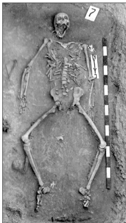
Fig. 1. A horseback-riding position with the deceased arranged as if sitting on or riding a horse (Kushaev, Jelezchikov 1976.4).