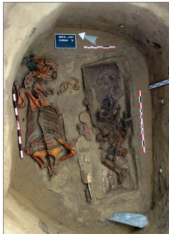
Fig. 3. A view of a horse burial (kurgan 72 in Berel burial site) (Samashev 2012.35).

In conclusion, from the earliest periods until today, sacrificing a horse as part of the burial ritual is a common custom within steppe culture. However, as is indicated above, sometimes a horse was buried and sometimes only a certain body part of the horse or some related equipment were buried. It is likely that this can be attributed to the inequality of possessions among nomads. In antiquity, nomads con-