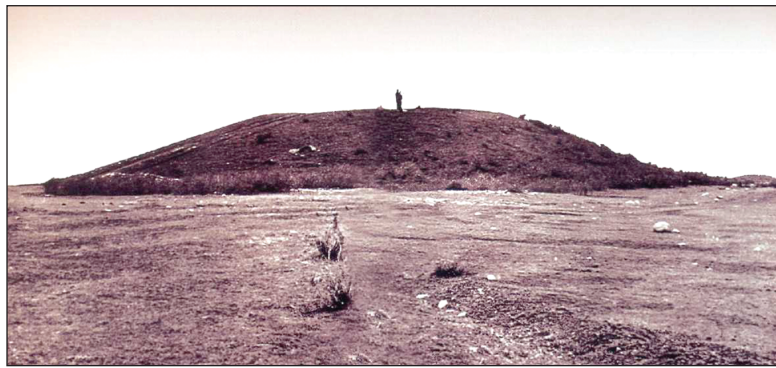
Fig. 2. A kurgan before the excavation (Issyk burial site) (Samashv et al. 2004.16).

Mentioning the examples which were found outside of West Kazakhstan unavoidably necessitates making a comparison of these to the similar ones found in other regions. In this regard we can make a comparison between the near and distant environments. In this study the near environment involves the other regions of Kazakhstan, while the distant envi-