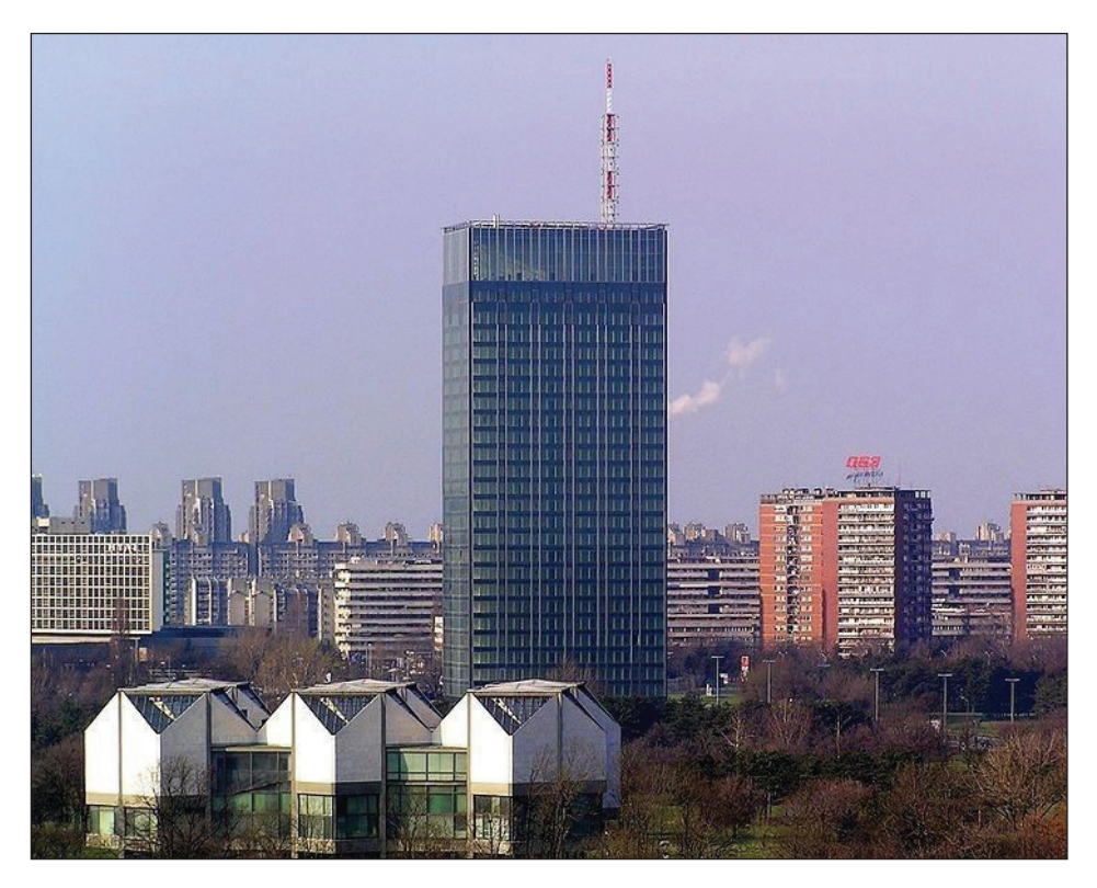
Fig. 1: View of the Museum of Contemporary Art and Mihailo Janković's skyscraper in Belgrade.

tractive assembly is the gleaming glazed skyscraper towering over 100 meters high which was designed by Mihailo Janković, the author of a number of other prominent buildings in Belgrade at the time when the city had been the Capital of Yugoslavia. In the Belgrade daily jargon, the tower is still referred to as the "CK building" (meaning Central Committee of the League of Communists) although its function was changed to a business centre in 2009 after the completing of the reconstruction of the building, which was damaged by the NATO bombings of 1999. This unique view could be taken as an allegory of the coexistences within the Yugoslav singular type of socialism, in which political power and culture in the context of the development of the model of the self-management system cohabited in a sometimes strained, but overall tolerant relationship. The fact that both buildings were designed in the modernist manner – and not, for instance, in a "monumental" Soviet style – speaks for itself.