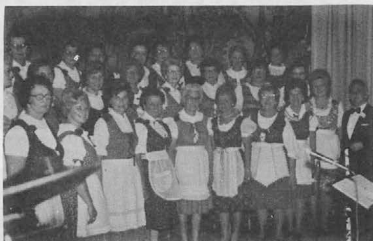
Combined Branches of Cleveland Singers – Dawn Choral Club, 1973