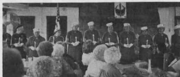
Cadet Candle-lighting, Memorial Ceremony

In the 1930 era, the Cadets were usually young unmarried ladies, whereas the present day cadets are mature women who not only bring pride to themselves and the branch but are contributing much to the current SWU activities of the branch. At the present, this is the only branch in the entire organization that enjoys the presence of "Cadets" in their midst. They have kept the tradition alive.