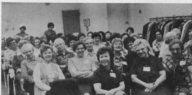
Initiation of New Members in 1983