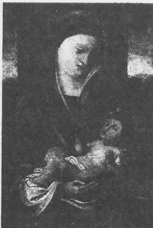
Ptjuska mati Božja