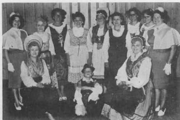
The representatives of the Combined Ohio branches pose for this photo which advertised the "SWU Slovenian Day" held on Oct. 1st and 7th in 1965.