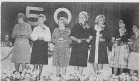
50 Year Members at 50th Anniversary