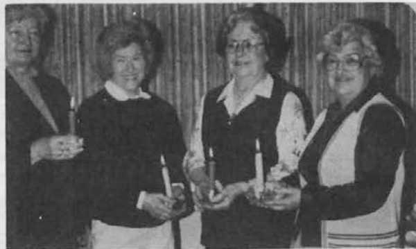
Initiation of New Members at a meeting.