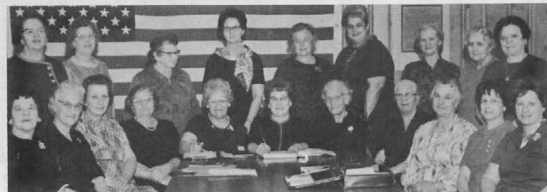
National Convention Committee of Combined Branches, 1969