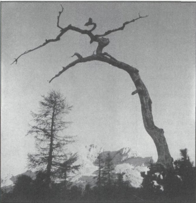
Fig. 6 Jaka Čop, »It is Dawning in the Mountains«, 1990.