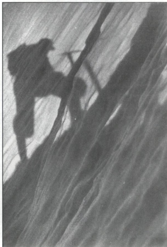
Fig. 4 Slavko Smolej, »My Shadow«, 1938.

A very different reading, totally unmodern, is suggested by the still from a video clip by the