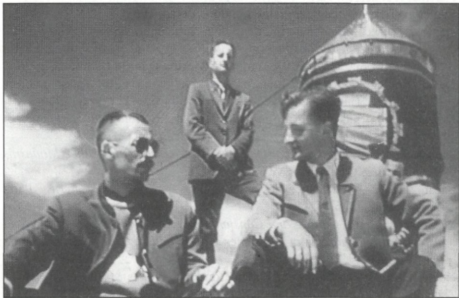
Fig. 7 Laibach , 1989.

music group Laibach (Fig. 7). As can be seen, the members of the group have wrapped a flag around Aljaž's Tower on Mt. Triglav. The group is a part of a Slovenian »retro-garde« movement from the eighties. Among its symbols are also Malevich's suprematist cross from 1915 and the cog-wheel which was a motif much used by socialist realist artists. By wrapping their flag around the tower, they have symbolically appropriated the symbol of the Slovenians. It is a case of postmodern irony, something which is totally absent from previous representations of mountains. In modernist representations mountains are always something serious, a grave matter, representing crucial issues, where laughter and irony are superfluous.