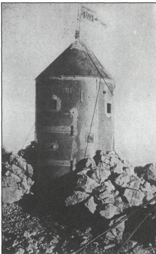
Fig. 1 Gustav Pirc, »Aljaž's Tower on Triglav«, 1895.

We see a dilapidated chalet in the mountains (Fig. 5). The poetic effect is achieved by its being a trace of absent people. It is a remnant of life long gone (into the valley and thus into an urban environment), a remnant of past life in these mountains which now, in modern times, has lost its original dwellers. Instead we have today city life, fast and far removed from our origins where we can perhaps escape over the weekend.