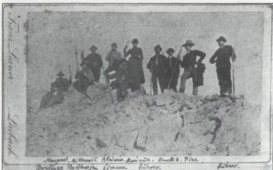
Fig. 2 Franz Leiner, »On Little Triglav«, 1888.