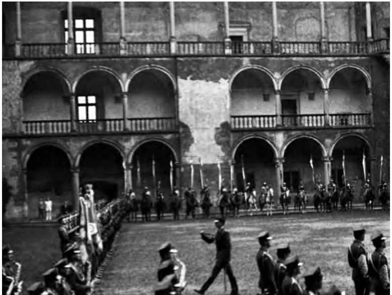
The 300th anniversary in the Wawel Castle 11 September 1983. From: Tron pamiątek 1696-1996 ku czci Jana Sobieskiego w trzechsetlecie śmierci (katalog wystawy) Muzeum Pałac w Wilanowie, Warszawa 1996.