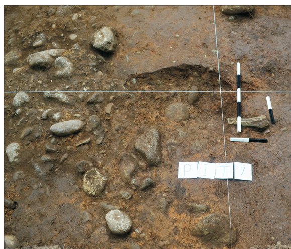
Fig. 3. Kobuleti: pit 7.

facts with 2-3 edge notches (Fig. 5.26-27,29-30, 33-35).