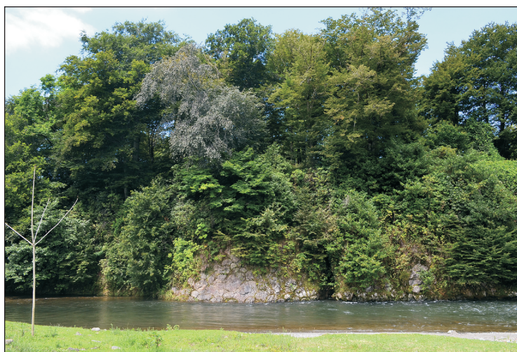
Fig. 2. Kobuleti: general view from the south.

The technique of blank removal is used to obtain blades and microblades by the method of manual