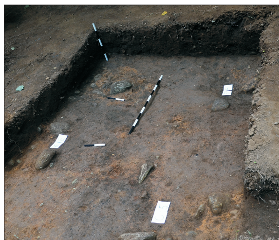
Fig. 4. Kobuleti: outlines of pits 7-12.

In general, the typology of the complex indicates that the site was used as a temporary hunting logistic camp, and very few production activities were carried out here.