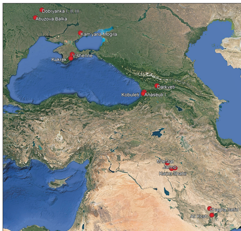
Fig. 1. Early Holocene sites with bullet-shaped cores and with microblades with abrupt retouch. Map of sites location.

Geographically, the site is situated on the Colchis Plain, which occupies a part of the coastal territory. The Kintrishi River flows along the southern part of the plain, at the very boundary with the foothills. Currently, the Colchis Plain belongs to the subtropical climate zone, but this does not mean that the climate was the same at the beginning of the Holocene, when the site was abandoned. At the beginning of the Holocene the territory of Western Georgia was characterized by a rather temperate climate; coniferous species of trees, including fir, spruce, and pine, were widespread.