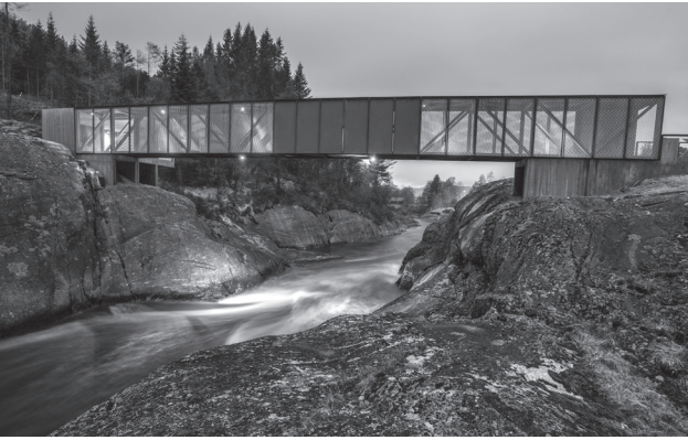
Fig. 3: An example of a gigantic joint: bridge Høse in Suldal, Norway, designed by Rintala-Eggertson Architects 2008-2013

Just as in the case of a small joint the joint itself is not directly visible; also in the case of a gigantic joint, the place itself is not directly visible. It is not a positive element of the situation, it is not something objectively given. Instead of a place, topos , it would thus be more appropriate to call it a non-place, a-topos . Because, to repeat once again, it is not an additional element that would appear on-site; we have before us only a bridge and its context. And yet it works, it has effects. It is present in its material effects, in the way that both the bridge and the landscape appear as objects of a special kind. As was formulated earlier, it seems as if they both appeared anew.