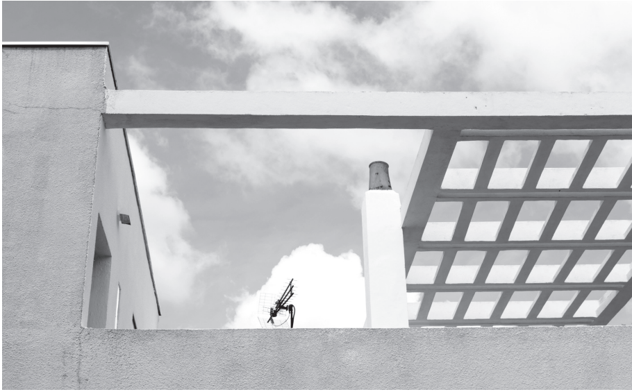
Fig. 4: Cité Frugès Housing in Pessac, France, designed by Le Corbusier 1923–1926; photo by Jeff Bickert.

ing for 1,500 families that also includes community facilities such as schools, sports centres, services and infrastructure. Another such project is the Quinta Monroy housing complex designed by the Elemental collective in Chile in 2006.