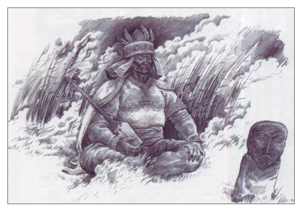
Figure 1. Kazakh musician. Artist Yeraly Ospanov.

selected concept to linguistic means of its expression; from the chosen key word, its semantics, to reconstruction of the studied concept. In this case a link between conceptual and semantic analysis is obvious: characteristics of the concept are revealed through the meanings of linguistic units representing them, their dictionary interpretations and particulars of combinability.