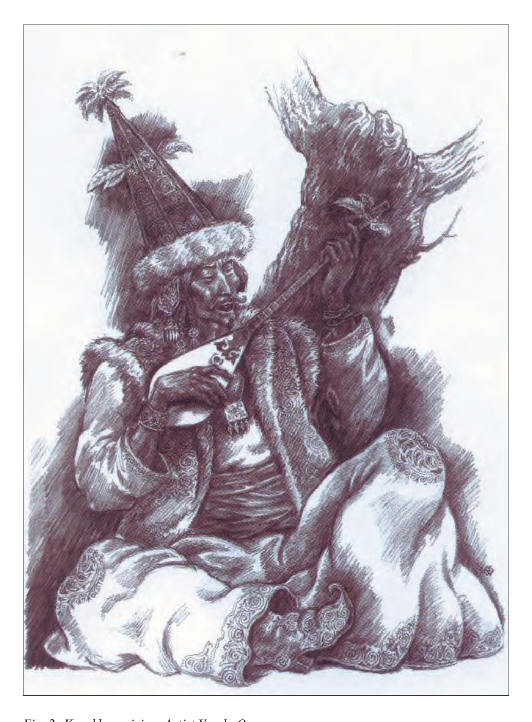
Fig. 2: Kazakh musician. Artist Yeraly Ospanov.