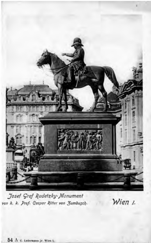
Radetzky's equestrian monument in Vienna