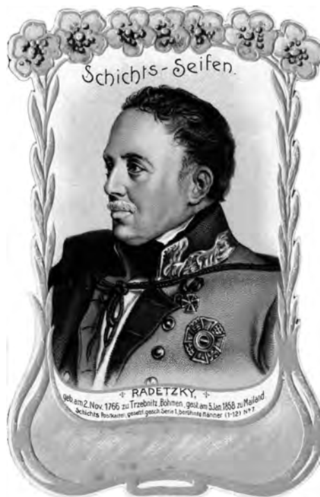
Count Radetzky on a trade card for Schicht's soap.