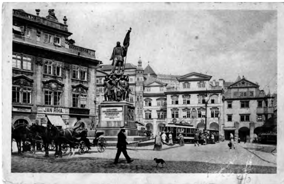
The first public monument dedicated to Marshall Radetzky was erected in Prague in 1858.