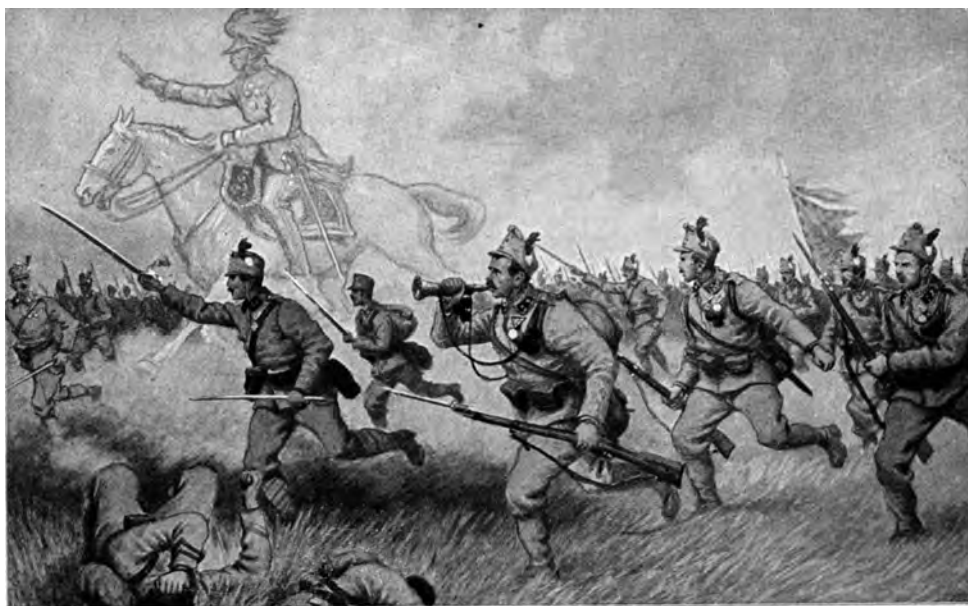
Im Geiste Radetzky's. — Csak neki, csak neki mind a fergeteg. — V duchu Radeckého.

In the spirit of Radetzky! (Austro-Hungarian war propaganda)