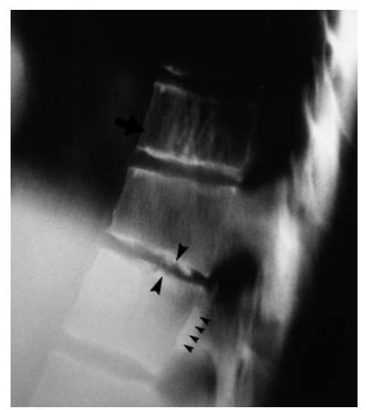
Figure 4a. Conventional tomography of the lower thoracic spine demonstrates calcified nucleus pulposus of the T11-T12 disc space (big arrow heads) and dorsal extrusion of the calcified material behind the vertebral body of T12 (small arrow heads). Findings typical of cavernous haemangioma of the vertebral body T10 are also seen (arrow)

ies. It has been proved that, in the absence of normal weight-bearing, the height of the vertebral bodies increase.<sup>18</sup> Conversely, the flattening of the vertebral bodies presumably indicates that the increased stress has been evenly distributed throughout the whole endplate reflecting the morphological appearance of widespread distribution of the calcified nucleus pulposus within the intervertebral disc. In comparison to other disc calcifications the nucleus pulposus calcification at the level of C6-C7, which ultimately herniated, was more abundant and globular in appearance. The initial MR examination (Figure 1b) revealed not only the expected signal void within the calcified intervertebral discs but also a slight disc expansion, most pronounced at the level of C6-C7, consistent with an increased intradiscal pressure, which was not so clearly demonstrated on the plain film radiography. Similar MRI findings have been already reported in discs without visible