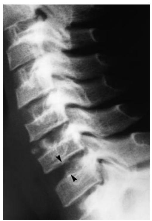
Figure 2a. Follow-up radiograph taken one year later shows disappearance of the nucleus pulposus calcification at the level C6-C7, which was most pronounced at the initial examination (arrow heads) and consecutive narrowing at the disc space.

was no neurological deficit and the laboratory findings were within normal limits. Lateral roentgenogram and conventional tomography of the thoracic spine showed findings typical of haemangioma of the vertebral body T10 and a calcified area in the posterior third of the intervertebral disc T11-T12. The dorsal herniation of the calcified material into the spinal canal behind the vertebral body D12 was also evident (Figure 4a). CT examination revealed the calcification of the nucleus pulposus and a narrow calcified tract leading to the rupture of the annulus fibrosus. Extruded calcified material was globular in appearance and localized in the midline within the epidural space (Figure 4b). The calcified nucleus pulposus and herniated masses were of low signal intensity on all MRI sequences.