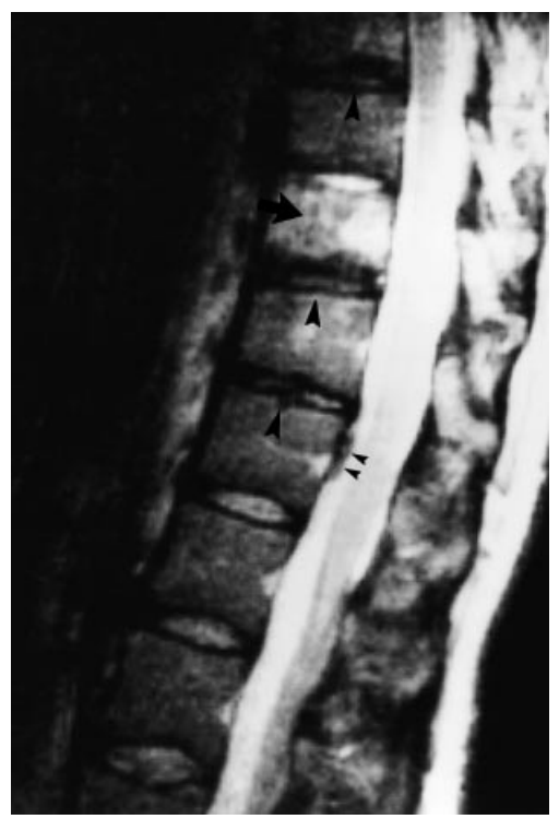
Figure 4c. Sagittal MR T2-weighted spin echo image (TR 1900 ms, TE 80 ms) shows decreased signal intensity of the intervertebral discs T8-T9, T10-T11 and T11-T12 (arrow heads) and normal signal intensity of the neighbouring vertebral bodies. The extruded low signal intensity calcified masses are clearly seen against high signal intensity CSF (small arrow heads). There is no compression of the spinal cord. High signal intensity haemangioma of T10 vertebral body is also demonstrated (arrow).

The most common site of the calcified nucleus pulposus is at C6-C7,<sup>19</sup> which as in our case, has also been a frequent location of herniations.<sup>1,2,11</sup> It could be attributed to the increased stress at this level produced by the transition of a mobile cervical to a fixed thoracic part of the axial skeleton. The narrowing of the disc space following the herniation (Figure 2a) indicated a disc decompression. Due to its well known high sensitivity for the