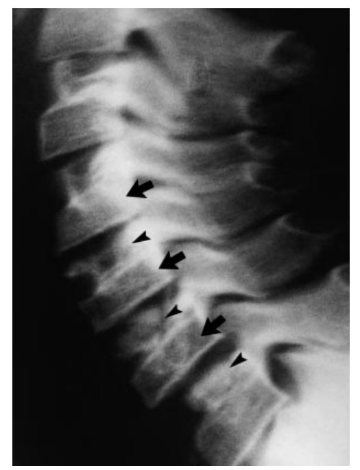
Figure 1a. Initial lateral radiograph showing calcification of the nucleus pulposus at the levels C4-C5, C5-C6, C6-C7 (arrow heads) and mild flattening of the vertebral bodies C4, C5 and C6 (arrows).

A seven-year-old-boy presented with lower neck pain, limited movements and stiff neck, a day following gymnastic activity at school. He could not remember having had any significant trauma. There were no neurological findings. The patient was afebrile, his ery-