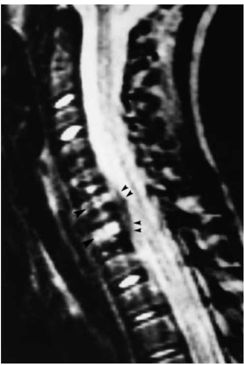
Figure 2d. On T2-weighted spin echo image (TR 2200 ms, TE 80 ms) high signal intensity bone marrow oedema is seen within the vertebral bodies of C6 and C7 (big arrow heads). Low signal intensity extruded calcified nucleus pulposus is clearly demonstrated due to neighbouring high signal intensity CSF on T2-weighted (small arrow heads).

The calcific deposits in adults predominantly consist of hydroxyapatite and may be of impermanent or permanent type.<sup>15</sup> In our case a longstanding clinical history and a radiographic follow-up examination which showed no signs of resolution suggested the permanent type of calcification. The results of the conservative treatment in our adult patient were not favourable. Her pain did not resolve completely, which was in accordance with the radiographic signs of a persistent calcification within the spinal canal. In the absence of the significant neurological im-