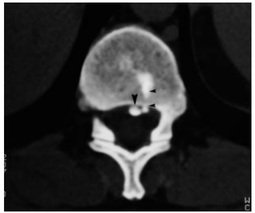
Figure 4b. CT examination at the level of T11-T12 disc space reveals calcified nucleus pulposus and narrow hyperdense tract directed to the left para-saggital rupture of the annulus fibrosus (small arrow heads). Extruded calcified material is globular in appearance and localized in the mid-saggital plane of the epidural space (big arrow head).

calcifications by Swischuk and Stansberry<sup>16</sup> who supposed that it could represent the initial phase of the disease entity. In our case the rupture of the annulus fibrosus occurred at the level of C6-C7 in which the disc expansion was most pronounced. These findings are in favour of the theory of an elevated intradiscal pressure.<sup>3</sup> On the basis of the MRI appearances it could be assumed that an initial phase of the disease may be characterized by an expansion of the intervertebral disc, presumably due to the osmotic absorption of water caused by an increased content of calcium salts within the nucleus pulposus. An increased intradiscal pressure makes the disc more vulnerable and ultimately leads to ruptures within the annulus fibrosus with a consecutive intradiscal displacement and/or extrusion of the calcified nucleus pulposus and disc decompression. These MR appearances also suggest that MR is probably more sensitive than radiography in depicting a disc widening and possibly that the most expanded discs are at highest risk for eventual herniations. On a follow-up radiography (Figure 2a) the disappearance of disc calcification C6-