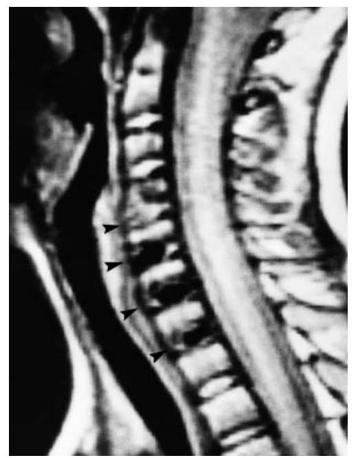
Figure 1b. Mid-sagittal PD-weighted spin echo image (TR 2200 ms, TE 20 ms) reveals signal void within the calcified intervertebral discs C4-C5, C5-C6, C6-C7 and C7-T1 (arrow heads) with slight disc expansion most pronounced at the level C6-C7. Note that the signal void at this level extends far posteriorly into the annulus fibrosus indicating the possibility of its rupture.

throcyte sedimentation rate and a white blood cell count were within normal limits. Initial lateral radiographs demonstrated calcifications of the nucleus pulposus at the levels C4-C5, C5-C6, C6-C7, C7-T1 and the mild flattening of the vertebral bodies C4, C5 and C6 (Figure 1a). MR imaging revealed a signal void within the intervertebral discs C4-C5, C5-C6, C6-C7 and C7-T1, findings consistent with nucleus pulposus calcifications and slight disc expansions most pronounced at the level C7-T1 (Figure 1b). Following the treatment with a cervical collar on an outpatient basis he became asymptomatic after four weeks. The patient was admitted to hospital for the second time one year later with mild left-sided torticallis. He complained of lower neck pain radiating to the shoulders. There was no history of trauma. Neurological