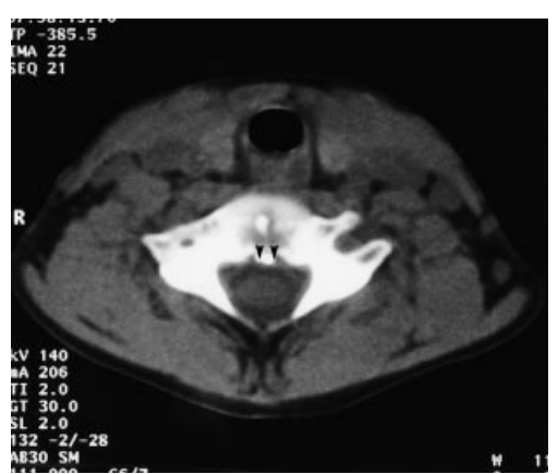
Figure 3. Control CT examination done after six weeks at the level of C6-C7 reveals a nearly complete resolution with only minimal remnants of the calcified herniated nucleus pulposus within the epidural space (arrow heads).

The mechanical stress is an important factor in modeling of the normal vertebral bod-