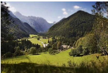
The Logarska Valley.

National Geographic Traveler in cooperation with National Geographic Society's Center for Sustainable Destinations, has devoted its sixth annual "Places Rated" Destination Stewardship survey to the world's most celebrated and iconic travel destinations and how well they have weathered the pressures of mass tourism and other threats.