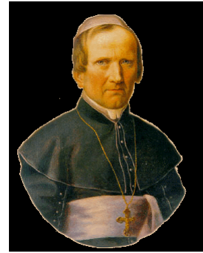
Bishop Anton Martin Slomšek

Apostolic Nuncio to Slovenia Santos Abril y Castello held on Saturday September 26 a mass dedicated to the late Bishop Anton Martin Slomšek, who made Maribor a bishopal city 150 years ago. The mass attended by some 8,000 people was the culmination of the Slomšek Year. Slomšek (1800-1862) moved bishop's seat from St. Andrae, some 50 km northeast of Klagenfurt, in today's Austria, to Maribor.