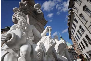
Fountain of Francesco Robba, Ljubljana.

Several Slovenian companies and institutions have launched a web portal which aims to attract tourists to the country by presenting Slovenia's heritage, urban areas and countryside, traditional food and life-style in professional and amateur photos.