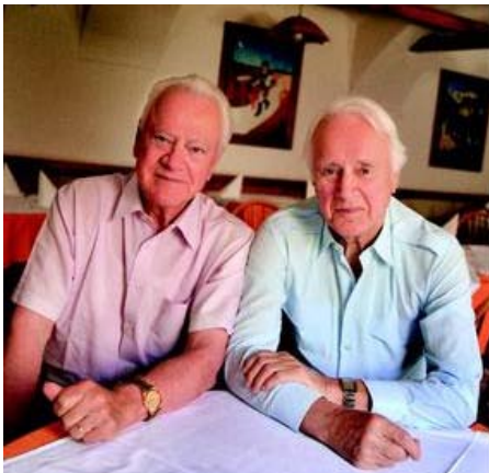
Slavko Avsenik praznuje 80-letnico