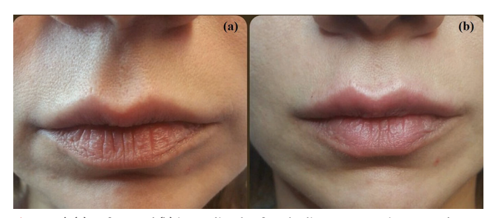
Figure 3 | (a) Before and (b) immediately after the lip augmentation procedure.