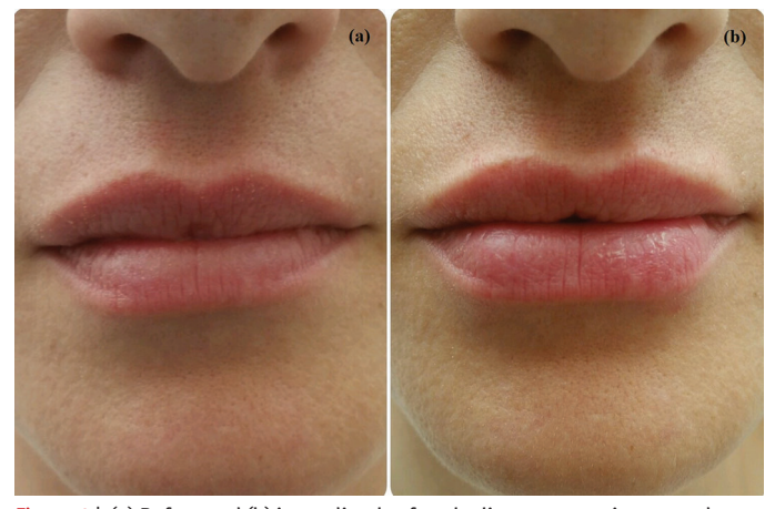
Figure 4 | (a) Before and (b) immediately after the lip augmentation procedure.