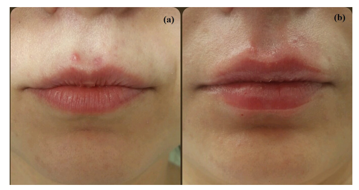
Figure 2 | (a) Before and (b) immediately after the lip augmentation procedure.