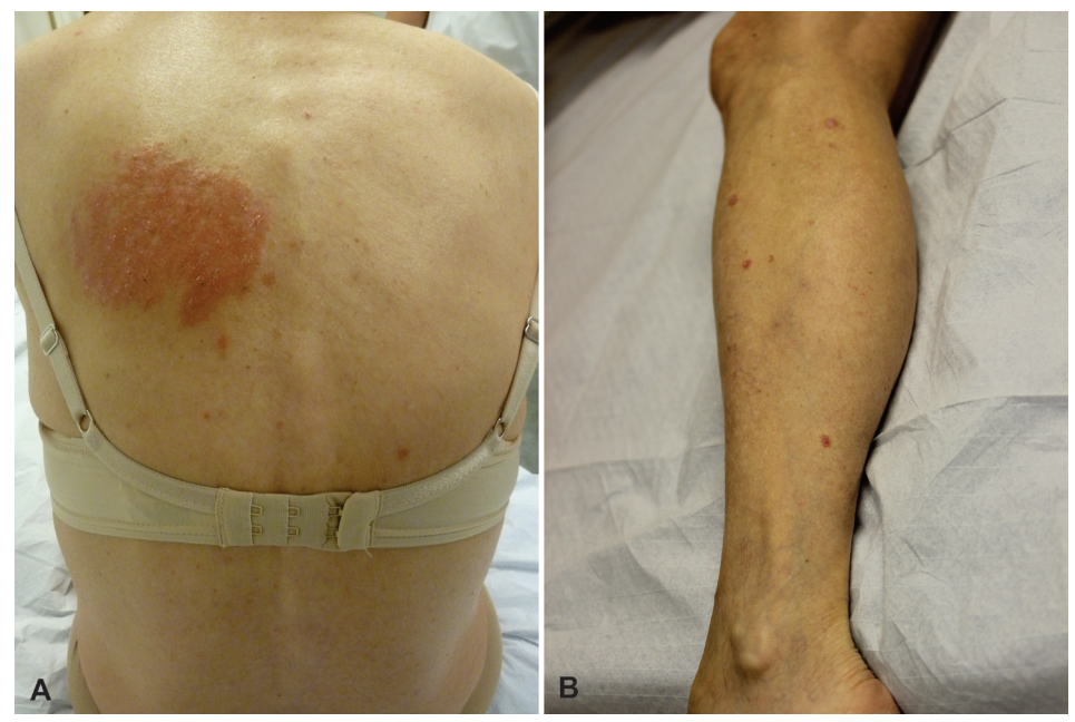
Figure 1 | A) Erythematous patch on the left side of the upper back. B) Itchy papules of the lower limb.