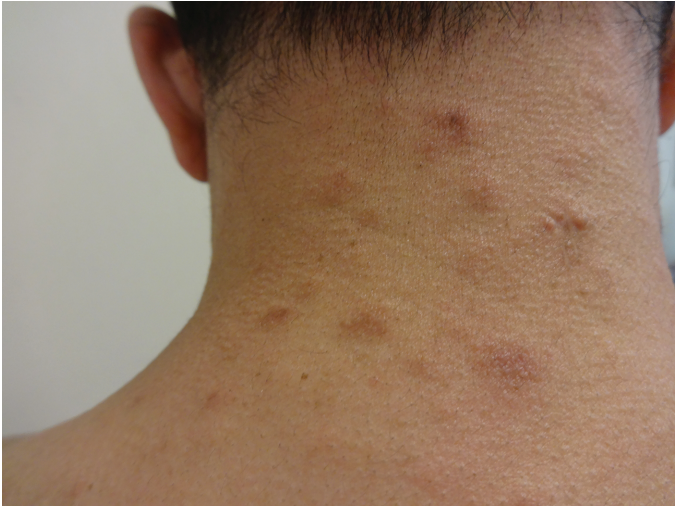
Figure 1 | Erythematous to brownish plaques on the posterior neck.

An otherwise healthy 36-year-old Caucasian male presented to our outpatient clinic with a history of 10 years' duration of progressive development of slightly pruritic hyperpigmented lesions that began on his upper trunk and gradually spread to the entire trunk, neck, and upper limbs. He denied fever, malaise, night sweats, or other constitutional symptoms and he did not have a relevant family history of hematologic disorders. On physical examination he presented with multiple reddish-brown ovoid thin plaques, up to 2 cm in size on his back, chest, neck, and upper limbs (Figs. 1–3). Neither lymphadenopathy nor hepatosplenomegaly was appreciated clinically.