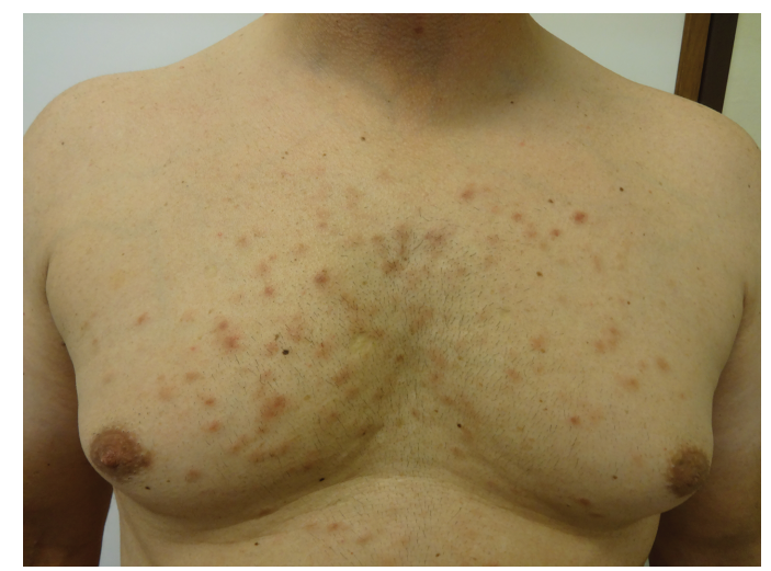
Figure 2 | Erythematous to brownish macules and plaques on the anterior chest.