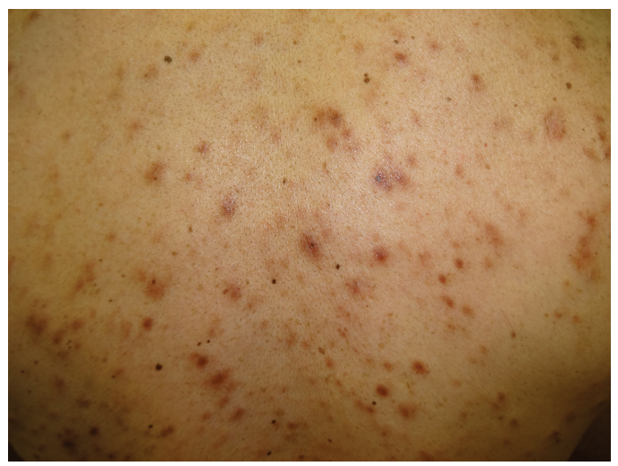
Figure 3 | Detail of erythematous to brownish plaques on the trunk.

Serum and urine electrophoresis were within normal range, with a normal IgG value ( 637 \, \text{mg/dl} ). Complete blood count, metabolic panel, antinuclear antibodies, and erythrocyte sedimentation rate revealed no alterations, with normal beta-2 microglobulin and interleukin-6 (IL-6) levels (< 2.0 pg/ml). Serum and urine immunofixation studies found no monoclonal immunoglobulins. The serological examination for syphilis, hepatotropic viruses, HIV, and Borrelia burgdorferi was negative.