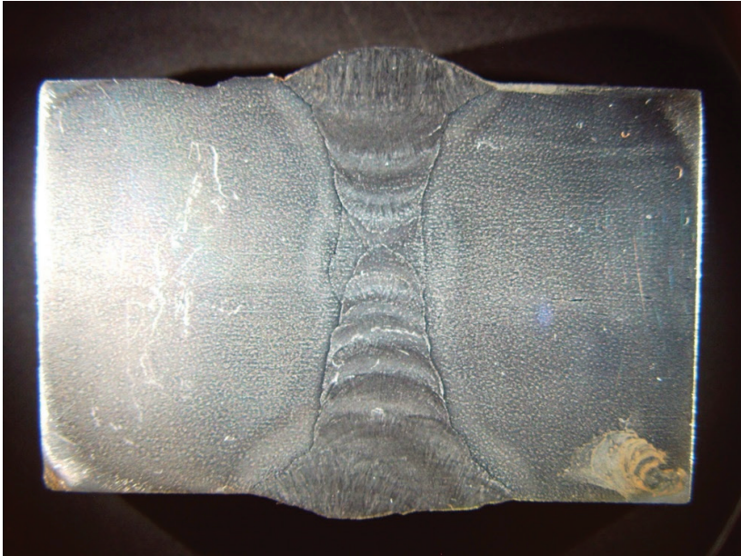
Figure 1: X form of a multi-welded weld joint

A lower strength weld was welded with eight various additive materials: