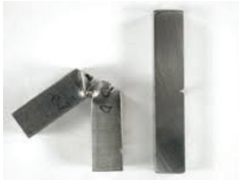
Figure 3: The appearance of the manufactured and broken Charpy samples