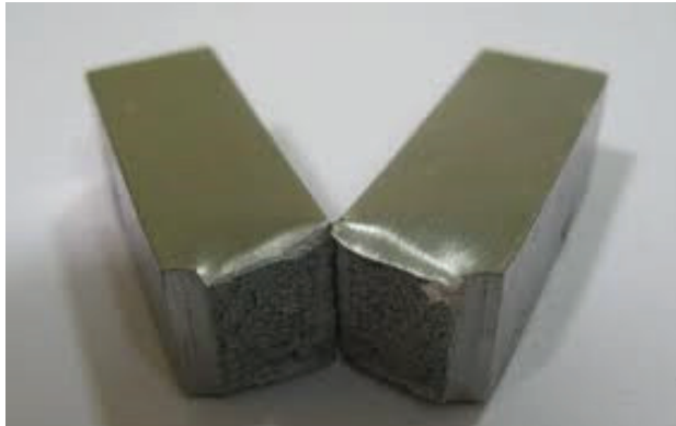
Figure 4: The appearance of the groundbreaking surface of the Charpy sample