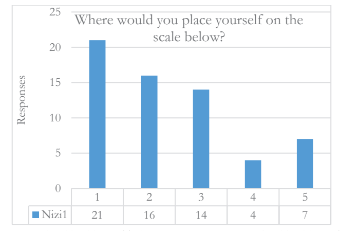
1 = I am very comfortable with LGBT+ issues; 5 = I am very uncomfortable with LGBT+ issues Figure 1: How comfortable are you with LGBT+ issues?