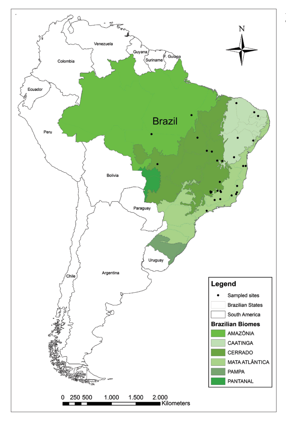
Fig. 1: Map of the study area covering 11 Brazilian states.

cave sampled (Heyer et al. 1994) The entire length of the studied caves was walked and inspected, with special attention to microhabitats with potential for species occurrence, such as cracks in walls and ceilings, beneath rock falls, amid sediment banks and accumulation of organic matter, temporary and permanent ponds and watercourses, when present.