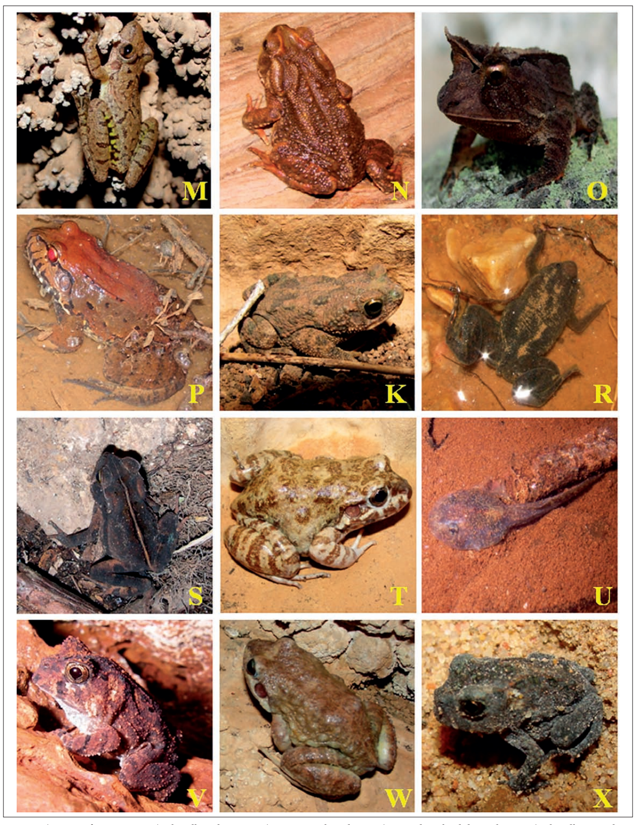
Fig. 3: M) Scinax fuscovarius; N) Rhinella rubescens; O) Proceratophrys boiei; P) Leptodactylus labyrinthicus; Q) Rhinella granulosa; R) Pipa carvalhoi; S) Rhinella crucifer; T) Leptodactylus troglodytes; U) Tadpole sp.1; V) Proceratophrys sp.; W) Leptodactylus syphax and X) Rhinella sp. (juvenile).