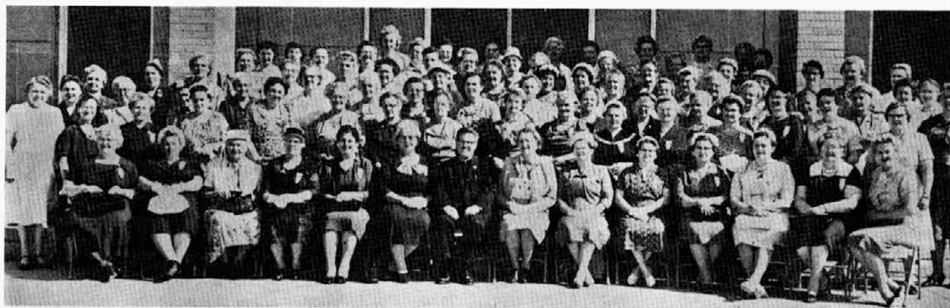
Delegates to the 12th National Convention held in Ely, MN on May 21-24, 1961 are pictured at the Convention headquarters, at the Church of St. Anthony de Padua Hall.