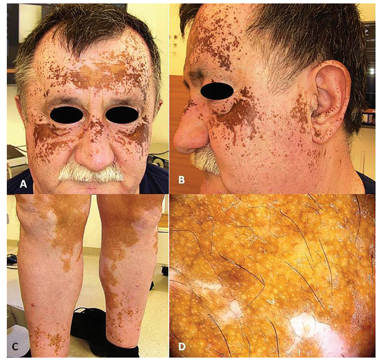
Figure 1 | Tanned coalescing macules on the (A) frontal and (B) left side of the face; (C) vitiliginous depigmentation affected almost the entire lower legs; (D) dermoscopy of the lentiginous repigmentation in the patient: a diffuse light brown background with a negative network and darker brown contouring of clear hair follicles.

tient has been suffering from vitiligo since early childhood with ongoing slow depigmentation over the years. The last treatment attempt spanned 5 years and comprised 300 sessions of narrowband ultraviolet (UV) B phototherapy (three times weekly) and topical tacrolimus. Only limited and short-lived repigmentation was achieved. He is otherwise healthy, taking no systemic medications. He did not report increased sun exposure; the average UV index in the patient's area of residence around the time the lesions appeared is 3. The lesions were dark brown macules coalescing into patches on his cheeks, forehead, nose, temples, and ears (Fig. 1A, B). Dermoscopically, on a homogenous light to dark brown background, lighter follicular openings were seen (Fig. 1C). Vitiligo was generalized, affecting the face, as well as large areas on the trunk, legs (Fig. 1D), and arms. A biopsy was taken from the