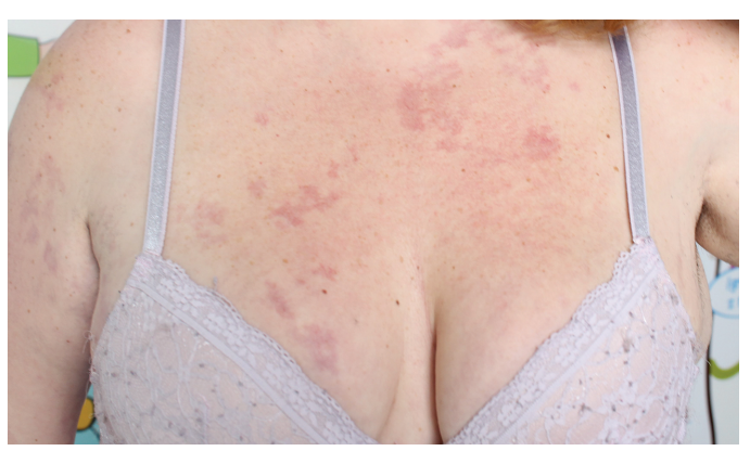
Figure 2 | Livid to erythematous macules on the patient's chest.

During the examination, asymmetrically distributed livid to erythematous macules of various sizes were visible on the skin of the face, torso, and arms (Figs. 1–3).