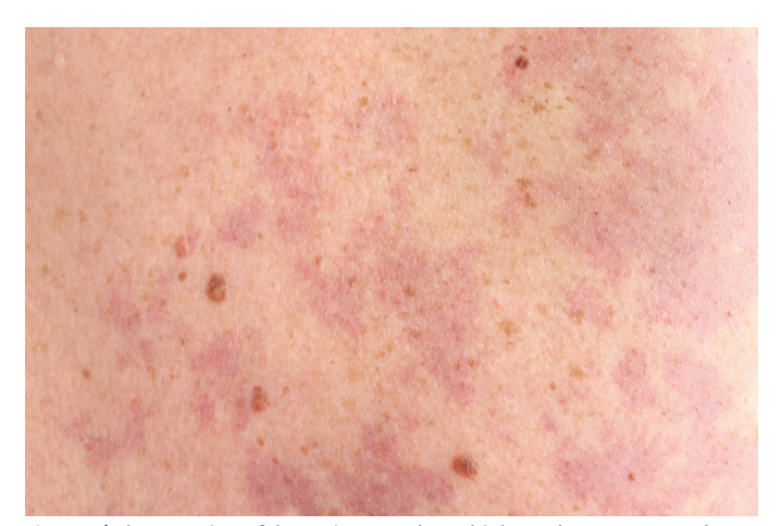
Figure 3 | Close-up view of the patient's rash: multiple erythematous macules.