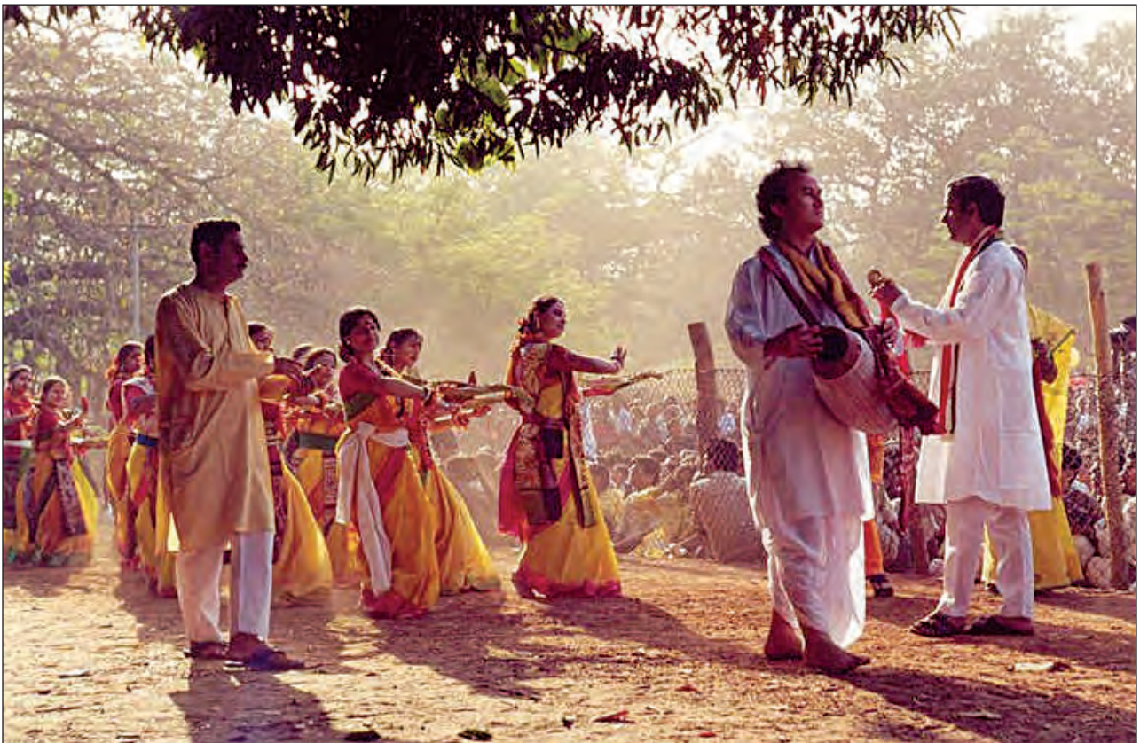
Dance performance in Santiniketan

the late-19 th century and early 20 th -century to counter both imperialist and nationalist discourses. Derrida's notions of hospitality have provided the analytical tool for exploring the tensions between unconditional ideals of hospitality encapsulated by the idea of the guest as god, and conditional hospitality delimited by restrictions of caste, class, religion and gender, which inform India's everyday laws of hospitality. In their every-day practices of (in)hospitality, Tagore did not want his compatriots to forget the ideal of guest-centric hospitality that gives the new arrival or stranger a more prominent place in the hospitality scenario: "We must use our social strength, not to guard ourselves against the touch of others, considering it as contamination, but generously to extend hospitality to the world, taking all its risks, however numerous and grave" (Tagore, 2002c, 465). Tagore's projected ideal of unconditional hospitality, however, must be seen not so much as an endangered species of traditional hospitality as an idealistic construct, or a constructed ideal, which is itself a product of an embattled colonial modernity. It can be related to a particular philosophical response to the larger question of freedom and selfhood against the conflicting cross-currents of modernization, westernization and reinterpreted Hindu traditions which Tagore had inherited as a Brahmo and took forward in his own way.